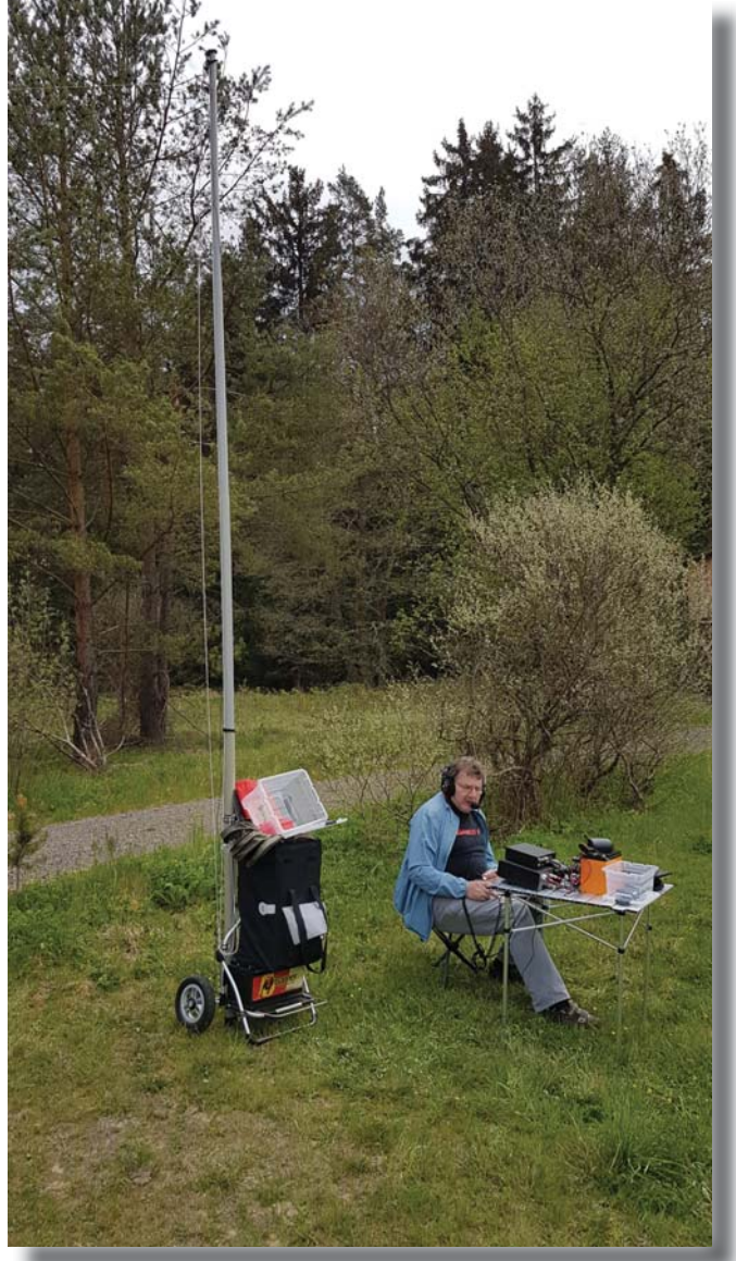
Manfred DF6EX forTeam DAØCW Ortsverband Stiftland - virtueller OV für WWFF u. COTA-Freunde