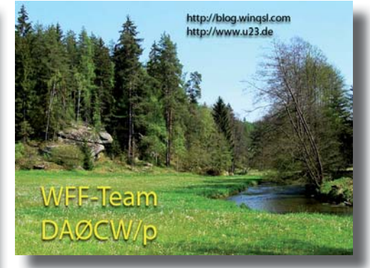
After having a nice trip to Leuchtenberg my wife and me decided to go also on sunday on a castletrip. With my OK8WFF-licence it was the Castle of Kynzwart which was our decision. However con-