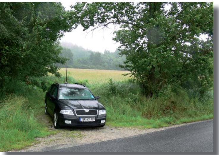
our location just before Kynzvart