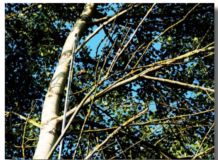
Günther DC2RK planting the stones for the wires over the trees

SP5KCR at 0707UTC. Then finally found a good frequency around 7.139 and it was running smoothly during the first hour there. In the meantime Xaver and Günther