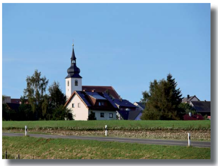
view to the city of Thurndorf

also. This fellow never sent in the log for EW4DXdatabase. That was why a lot of hunters had it, but not confirmed. So our plan saw that we will make a tour to this park also. But in july when we planned our next team-trip we had the decision to go either to OKFF-012 or DLFF-061, both with nearly the same distance for us we favorized the Cesky Les activity and made our best scoring 1000 QSO-trip since we started. Then later the year we decided to make the two new one activites from Haßberge DLFF-064 and Steigerwald DLFF-117. However into the head I still had some plans for DLFF-061. When I was in the area together with my XYL in early july we selected a location for the planned team-tour, but when checking with the latest map-material I found that one critical as too close on the border between DLFF-093 and DLFF-061. DLFF-093 is one of the easiest parks in bavaria. There are two