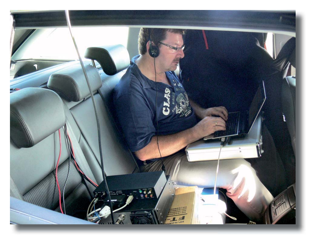
little limited place in the shack

populated by farmers and their heavy machines but then when surrounding the area a second time we found an ideal location on a hill called Kalvarienberg at 650meters ASL. As we learned later, this location will be also used for VHF/UHF-contest from the local hams. After mounting of mast and antenna finally the operation started with US5UZ at 1158 UTC on 20 meters. Of course