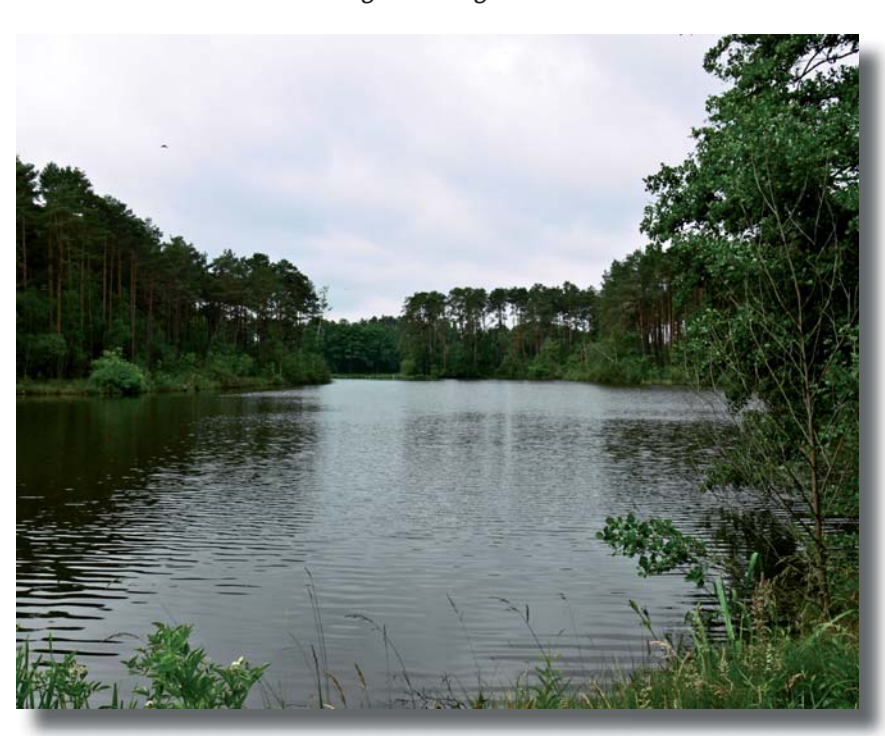
view from operating position in DLFF-144

Charlottenhofer Weihergebiet is one of the biggest nature reserve in the upper palatinate, located about 50km north of Regensburg in northern bavaria. More than 100 different bird-species like sea-