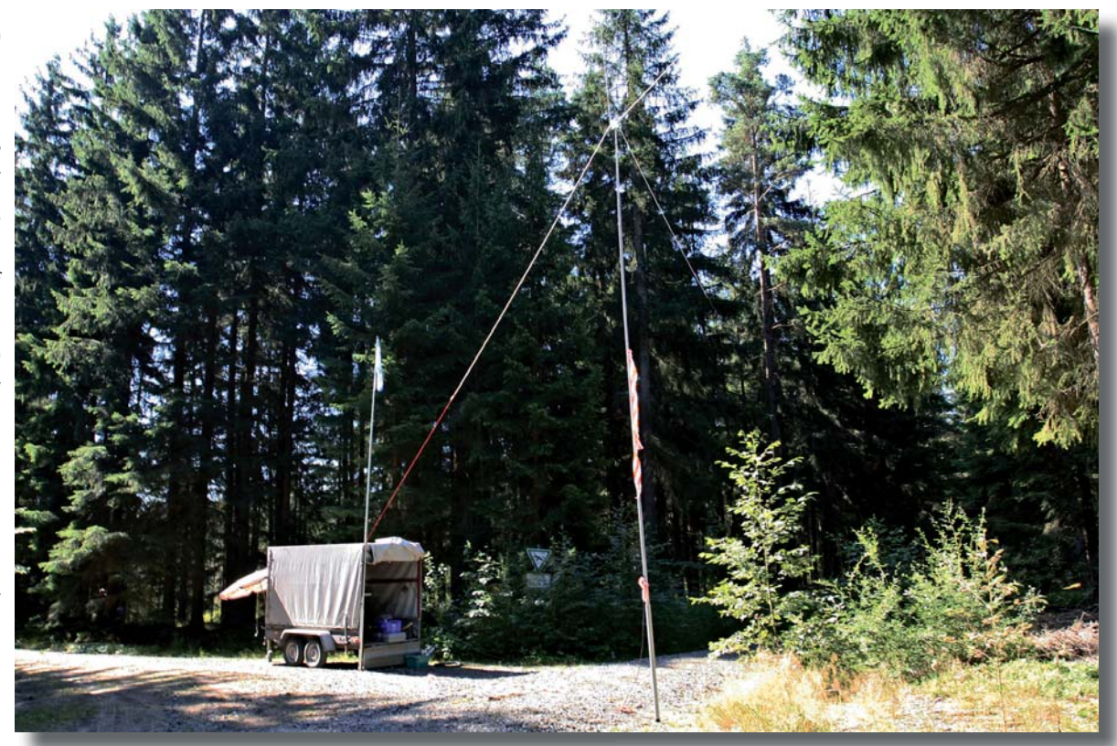
Station 1 located directly on the wood-track with the 40/20-meter antenna

beginning on 40 meters but than it dropped down rapidly. There was so many activity on 40 that it was difficult to get a frequency and if you finally had one to defend it. Also again very tricky the conditions. The first run on 40 nearly without any german station. The second run brought nearly only german stations in the log. Conditions were changing rapidly. On 20 meter was a