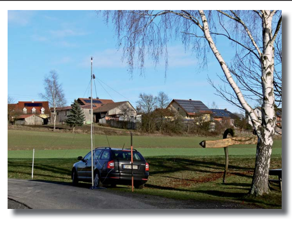
lookup to Falkenberg

MHz. At the final-end tried again 14 MHz and could continue there with some stations from spain, finland, great britain and finally beside some siberian stations the contact with Bill W10W in massachusetts. As antenna used a double-dipole for 20/40 Meters in about 5 meters above the ground. Transceiver was an FT-450 with 100 watts powered from a second carbattery. Operation ended at 1332 UTC, so nearly exact two hours with a total of 230 contacts in altogether 32 countries. 42 contacts with germany, followed by 41 contacts with italy and after that 26 contacts with russia. My electronic-keyer decided again to work not this day. So finally had to do all contacts in phone. With such a nice weather there was also a high number