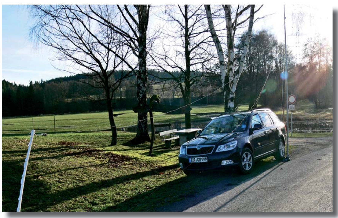
in the background the location from the last time deep under water

The nature-reserve Waldnaabtal was elected for the World-Wide-Flora-Fauna-program in the first half of 2012. First activity from there was at june 30, were in a good 6 hours-operation altogether 760 stations could be worked.