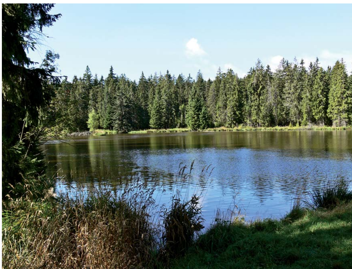
view behind the mobile-shack was worth to see

new-one activation of this year I have to say, that it seems the interest is going down a bit, for sure a reason the problems in WFF-organization of the past. Of course also the propagations especially on 20 meters were mostly not so well the past weeks. There is still a number of stations which are extreme active and still want to work any flora-fauna area. However it seems that the broad mass of stations is still going down and of course is dividing more and more for the high number of activations. That was also the reason why I con-