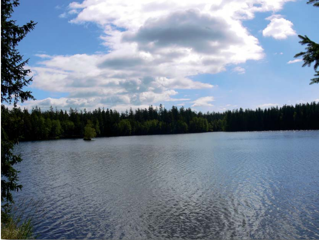
The biggest sea in the reserve Kladske Rybnik the „kinglake“

Nature-Reserve „Kladske Raseliny“ is one of the largest and oldest natural reserve in the area of Karlovy Vary (Karlsbad). The marsh-region consisted by 5 different marshes is an absolutely unique example of high marsh in a region with a height of 800/930 meters asl. The total size of the marsh area is 300ha. The marsh-floors are the home of very specific animals and plants. On a 2 kilometer long wooden path you can go directly inside the marsh-area and visit the various species. Kladske Raseliny is the most important area from the national park Slavkovsky Les (Kaiserwald) OKFF-006 and the water is feeding the sources of the famous palace of Kynzsvart.