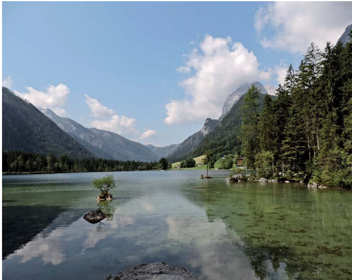
View from Lake Hintersee to the surrounding mountains

We spent the whole day on 12.july in the National-Park starting in the area around Lake Hintersee on the western end of the park. Our excursion took us around the see through the wooden areas along the magic wood with very interesting and fascinating water and stone-arrangements. We were walking and relaxing till the late afternoon. Personally I nearly had given up the plan to be active also from this park but my xyl