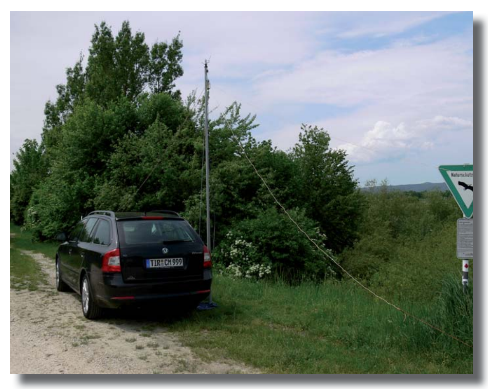
looking nice at the begin

contest should be over. For sure there were a lot of people outside to enjoy the rare beautiful weather