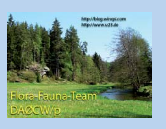
Nature-Reserve Eastern Chiemgau Alps has a total size of 9757 ha and was elected as nature-reserve in the year 1955. It 's located between Schneizlreuth in the east and Reit im Winkl in the west.

Back on tour from austria we passed the beautiful mountain-scenery and were again on the trip to Steinpaß. As it was not too late in the afternoon, we decided to add another new one this day on the germanside. It took us from Schneitzlreuth a bit more than 10 km in the near of the city of Inzell. Just a small piece before Inzell we had to leave right on a serpentine-road directly upwards into the Eastern Chiemgau Alps. The road is the german alpine road with a lot of beautiful sightseeings on the whole way. When arriving nearly on top we started very quick to set-up the station as it looked more and more darker.