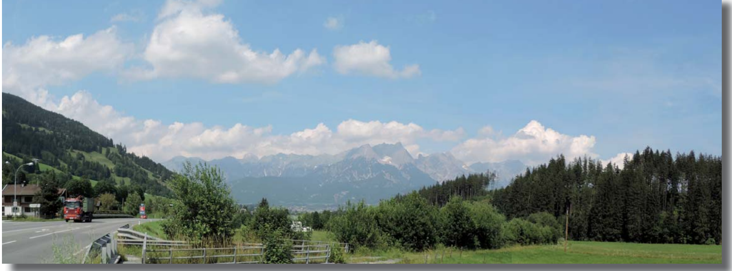
A view just before leaving Austria

Back on tour from austria we passed the beautiful mountain-scenery and were again on the trip to Steinpaß. As it was not too late in the afternoon, we decided to add another new one this day on the germanside. It took us from Schneitzlreuth a bit more than 10 km in the near of the city of Inzell. Just a small piece before Inzell we had to leave right on a serpentine-road directly upwards into the Eastern Chiemgau Alps. The road is the german alpine road with a lot of beautiful sightseeings on the whole way. When arriving nearly on top we started very quick to set-up the station as it looked more and more darker.