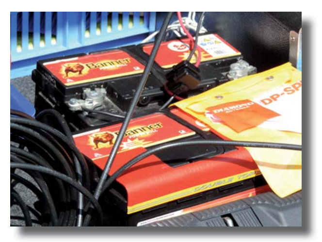
power on board