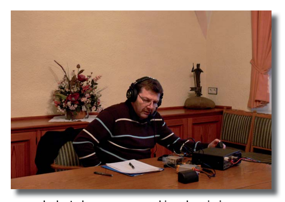
lucky to have a warm working place in january

http://blog.winqsl.com in english http://www.u23.de in german