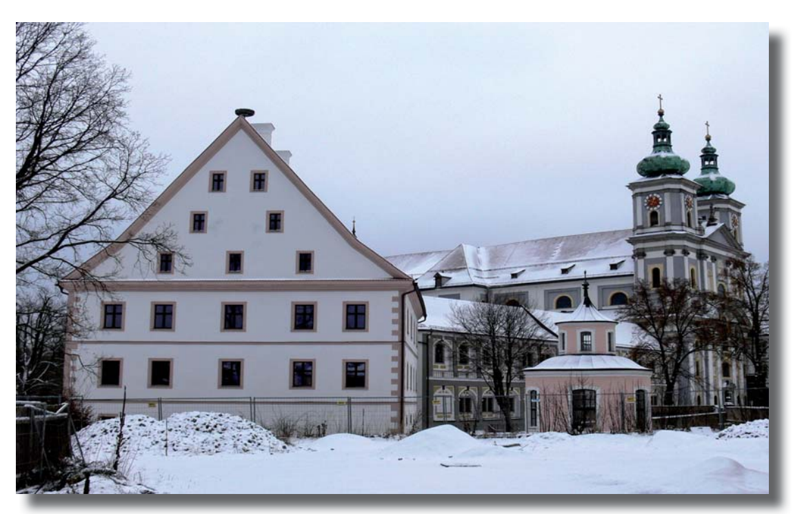
Abteischloss Waldsassen in front with the Basilika-church in background

In the first half of the 15th century various robberys came across the abbey of Waldsassen, mainly from the hussites. The monks decided to build a castle surrended by water. Together with four