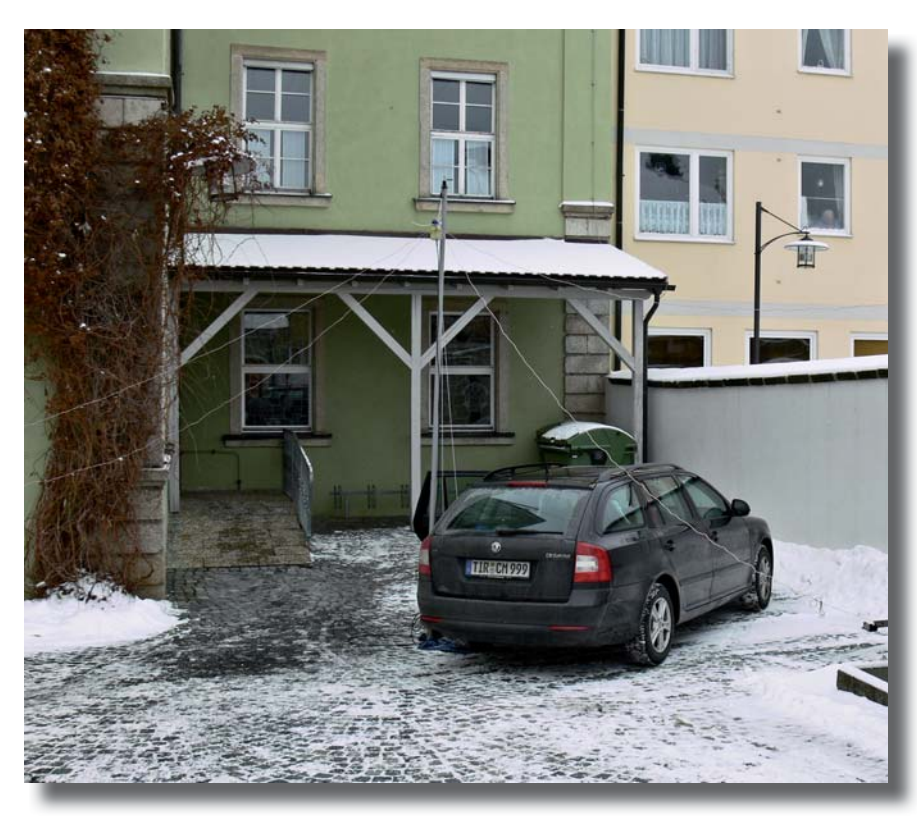
antenna-setup behind the major-house

Lot of stations calling and the log was filling smoothly. The good run lasted nearly 1,5 hours and I had again the biggest result on 40. When conditions were closing there I tried 20 meters SSB with again a good opening. Worked about 60 stations in 40 minutes before it broke down.