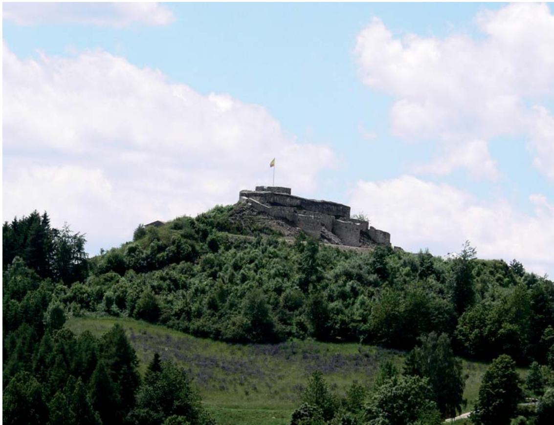
Castle of Waldeck

Since 2004 they began with the works to grab out the building and started with restoration. Location of the building is on a top of a basalt-cone at 641meters asl on top of the small township of Waldeck in the middle of Nature Park Steinwald.