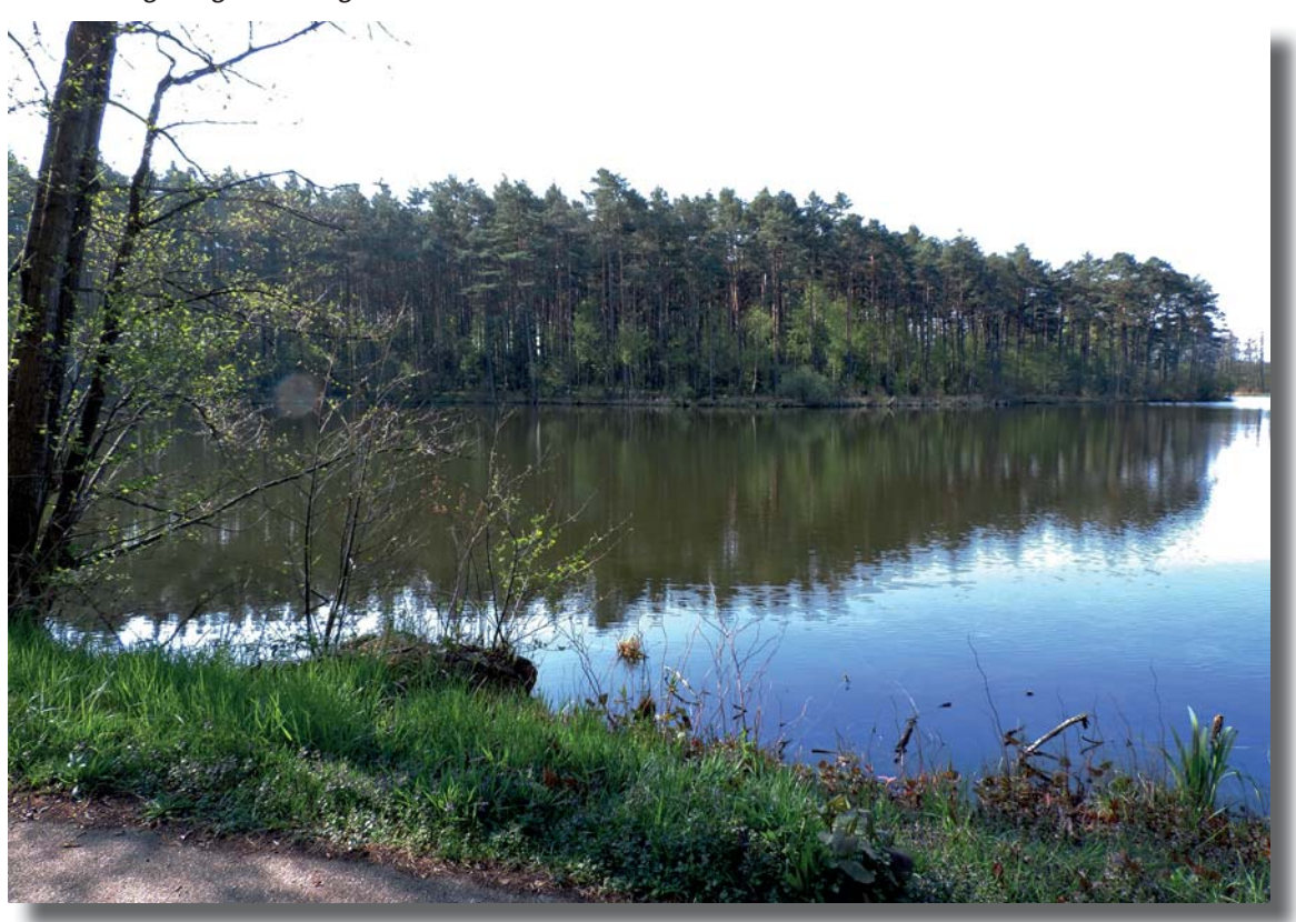
Location beside Räuberholz-Weiher

Nearly two years after my first activation of this area and no more activity from there thought it's time to go again to give out the counter for some new collectors. The area is easy reachable for me