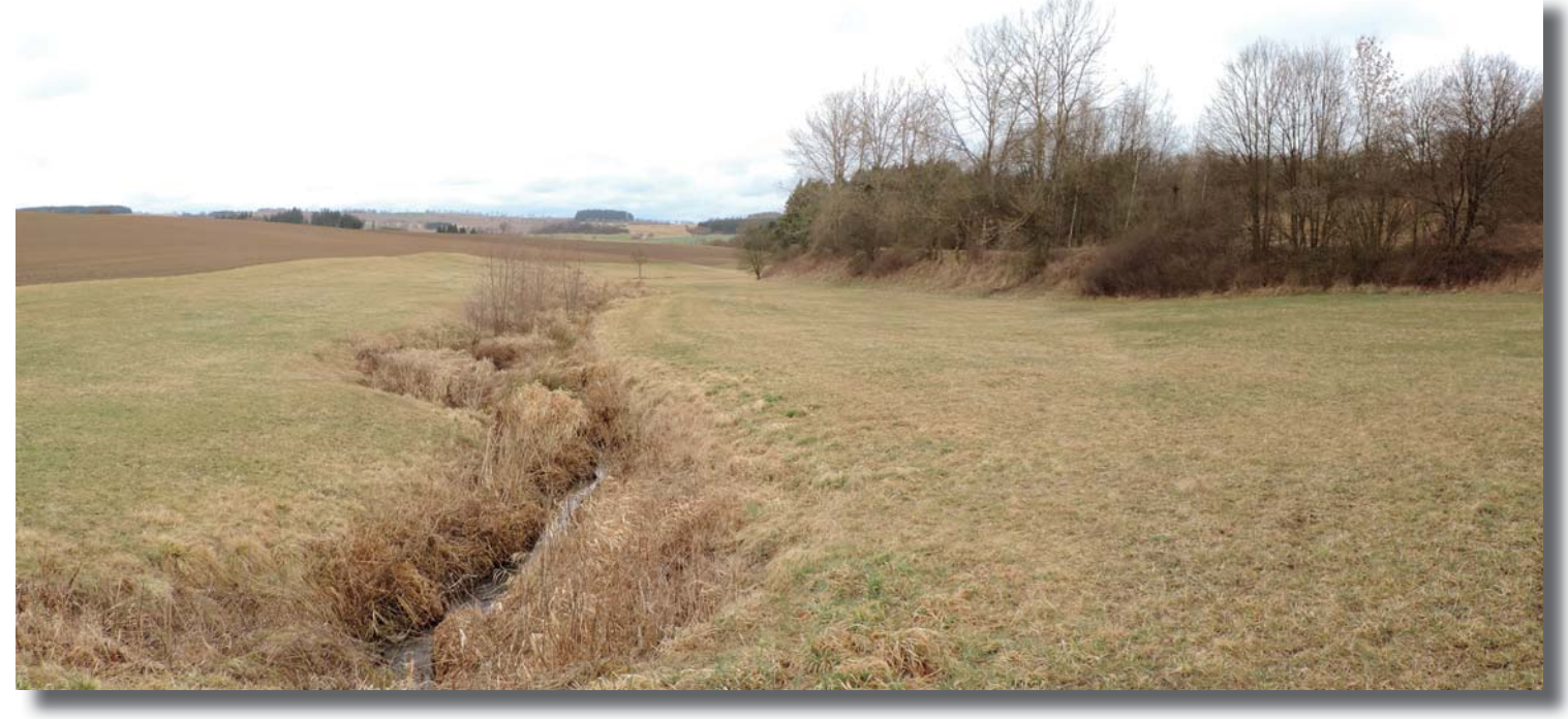
Zinnbach wounding through the meadows.

Südliche Regnitz und Zinnbachtal is a nature-reserve IUCN-cathegory IV and was elected in 2001. The total size is 145ha. The area is closed to the earlier three-country-corner also called in historic times three kingdom corner at this time bohemia, saxonia and bavaria. Of course thats history and you have now a nature-reserve on czech side, as well as in germany. The small water Südliche Regnitz is the result of the junction of two small ones coming from Czech Republic. Until the year 1947 this was the