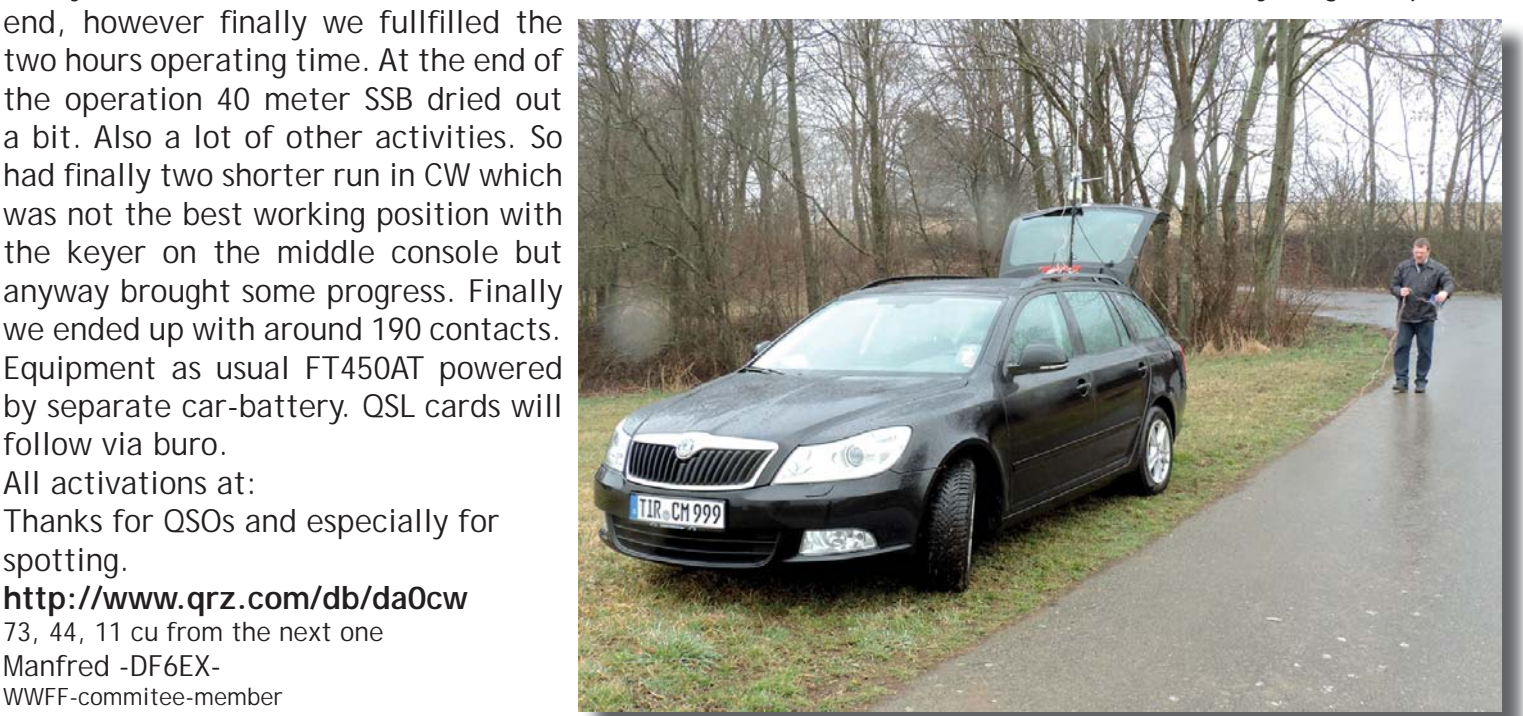
Raining on and on during setup

73, 44, 11 cu from the next one World Castle Activator Group #036 COTA-Team-Germany #037 SPCFF-honorary-member #004