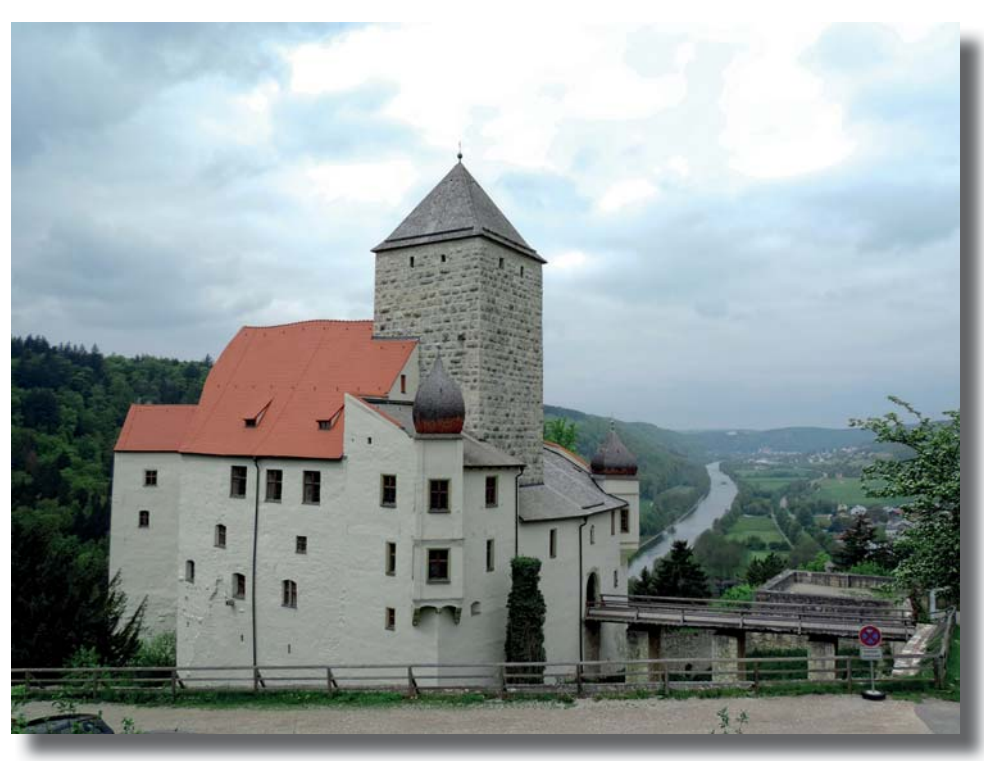
Castle of Prunn with Main-Donau-channel in the backgroud and a great view into Altmühltal

The Castle of Prunn was built on a steep rock and is located near the city of Riedenburg. The first documentation was back in the year 1037. 1228 the castle was sold to Duke Ludwig II from bavaria. The castle was occupied in the late 15th century however never was destroyed. During the following