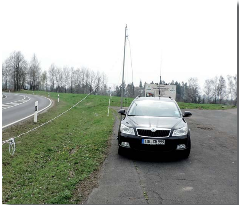
Setup on the other end of the village

Logs already were uploaded in the online-databases: http://logsearch.wwff.co http://www.wcagroup.org http://logsearch.cotagroup.org