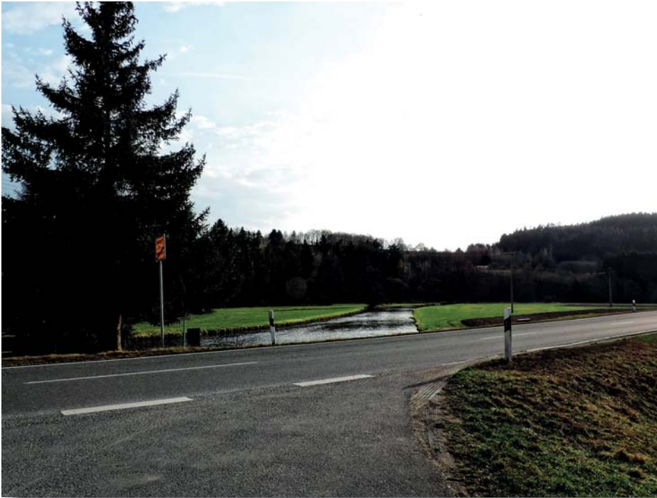
Hohenberg, were River Eger crosses

it this time as Nr.1 in the log and spotted me directly the resulting pile up was not much smaller than the WWFF-pile-up in the morning. The received reports were excellent so could work down the first 100 stations in 40 minutes. Also 20 meters generated a lot of contacts. So finally after a total working time of 75 minutes finished with 164 stations in the log. Also the first activation this day from OKFF-0963 would have been in a qualifying distance for the castle (about 600 meters) however the rules state that you can activate a castle only from the country were the castle belongs to. So this was