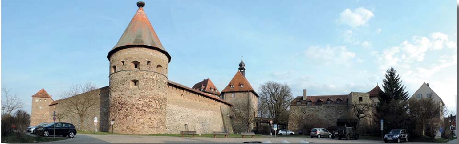
Castle of Hohenberg with the nest of Adebear on top.

The Castle of Hohenberg is the castle in best condition in whole Fichtelgebirge. It marks a hexagon in the footprint arranged by three rounded and two angled towers and the outer bailey in front. In the court there is a royal house dated back to 1666.