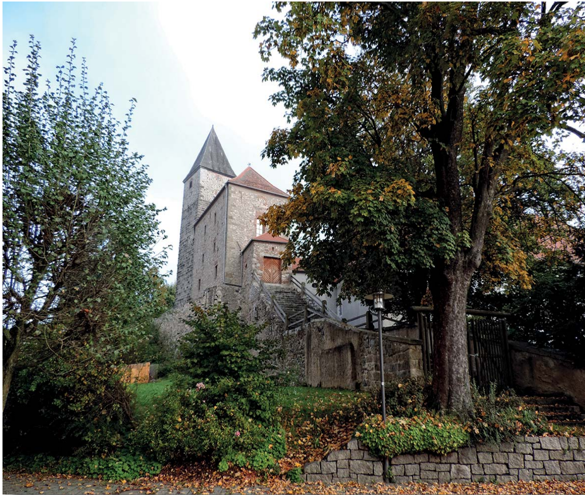
Castle of Waldau on a foggy morning in october

Not too far away from the big fasttrack A6 which is connecting czech republic and germany near the town Vohenstrauß you reach the small village Waldau. From big distance you can see the two towers. One belongs to the church the other one to the castle. The history goes back till the 13th century. The grey-green stone which is the basement for the castle belongs to the oldest stone-types (Serpentinit) in middle-europe and is under nature-protection. (abt. 1200 million years old) Castle Waldau got the name from the dynasty of Waldau. Heinrich from Waldau was banned by the church in 1315 after he deprecated the church