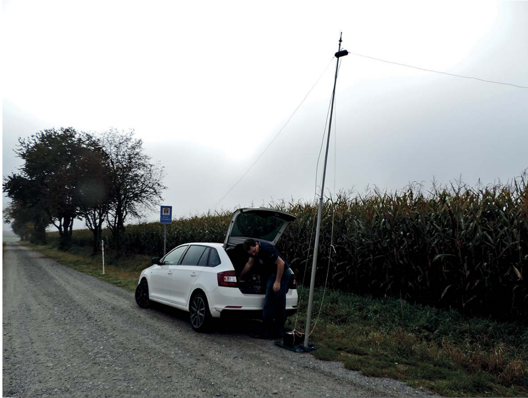
portable-setup at DL-04328

in our DARC-club gave me the information on that castle and this was the intention to bring it into the WCA-listing. The sight this morning was less than 50 meters and it was no far trip however a slow one. Finally arriving there we made at first some search and photos around the castle and the church. The village itself is combined in the centre by very small roads. So we finally drove out a bit at the end of the town and assembled the station beside a field.