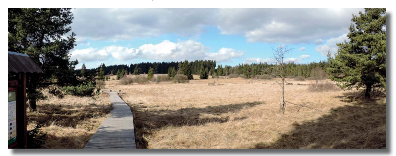
view into OKFF-0299 when sunny, unfortunately during activation weather was much bader

There is no way into the area of OKFF-0299 with car except at the lower end of the nature-reserve. So the moving from the first part of the activity and the second step took not too long. However area was not so free with lot of trees surrounding. Between the last QSO from OKFF-0247 and the first from OKFF-