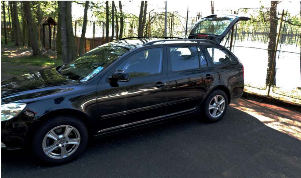
location on the lake

later than expected started the first call at 0905 UTC and this time Klaus DL7UXG made nr. 1 in the log. After his first spot the first wave of stations appeared however pile-up was not so big today than usual. Seems that lot of hams enjoyed the nice weather in the morning their own. Temperature at our location was nearly reaching the 20 degrees. Getting closer to the midday absorption the QSO rate slowed down rapidly. Also did several attempts on 20 meters in CW and SSB however not so well conditions there between the trees. Anyway some of the old friends from various countries made it