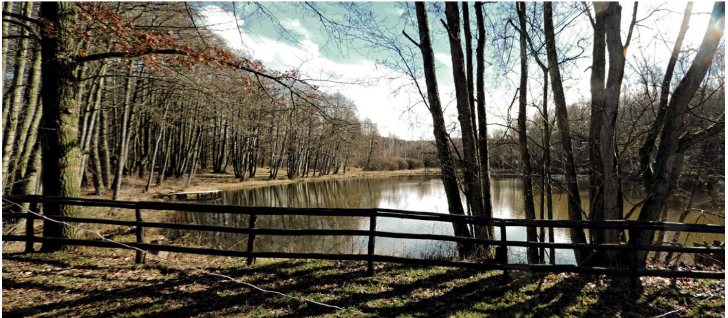
A panorama-view from Pomezni Rybnik, called in german „Scheitelteich“

Pomezni Rybnik is the border-lake between Czech Republic and Germany on the border-crossing driving from the small town Schirnding to Cheb. The borderline is going through the middle of the water. In Czech Republic the area around the lake is building the protected area Pomezni Rybnik. The calla and the common sundew are rare plants growing there. There are also a few rare animals like the crested newt plus various types of dragonflies living there. The total size of the area is 1,7 ha.