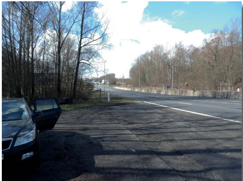
Just a few meters in OK