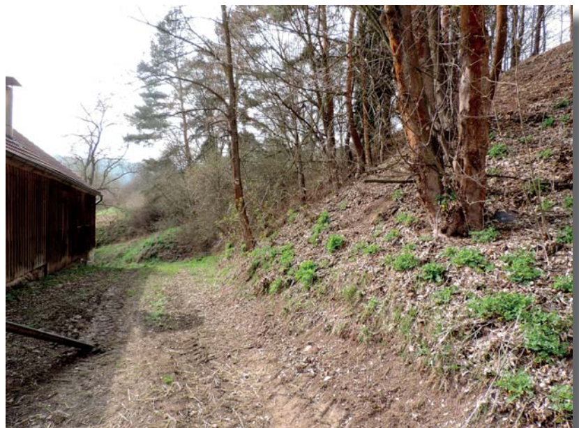
border is in the middle of this way, right is OKFF-0963

morning and overcasted we were lucky and it started to be a pleasant day. From the announced starting time we were again only a view minutes away. At 0726 UTC made the first contact with DL8ARJ and then the usual pile-up appeared. 40 meter was very busy but could defend the frequency a long time. 136 contacts could be done in the first hour. Changed also between CW and SSB. Before the band change had to put down the 40 meter antenna at first. There was only space for one dipole so when changing from 40 this would be the definitely QRT on that band. The up and down from the antenna took me around 20 minutes and started on 20 meters at 0915 UTC. Of course there were as usual plenty of other activities and it took