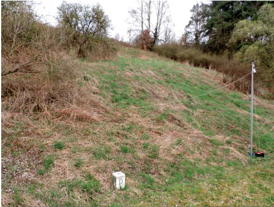
putting equipment to OK

three attempts to get a more or less clear frequency. Tried also on this band alternatively CW and SSB but of course was not so productive here. However some russian and ukrainian friends made it in the log which had no propagation before on 40. ODX was W2/CT1GIF who worked me under a lot of operations before as well. After exactly two hours of operating time the voice was nearly gone and also the conditions were going down so we decided to end here. Altogether 260 contacts were made and are already uploaded to the WWFF-database. A new QSL-Layout will be done for this and coming activities and will be send out in a few weeks separately via the buro. You don't need to