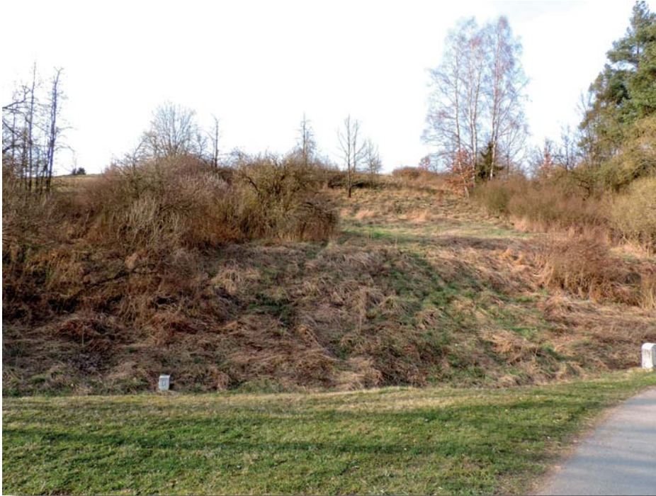
view from the german side

Strán u Dubiny is a nature-reserve IUCN level IV with a total size of 9,9 ha and located directly on the german border. It's not too far away from the city of Cheb and also going along of the river which is the borderline between Czech Republic and Germany. The two neighbor villages are Liba on the czech side and Hohenberg on the german side. The area is protected for the presence of rare flora.