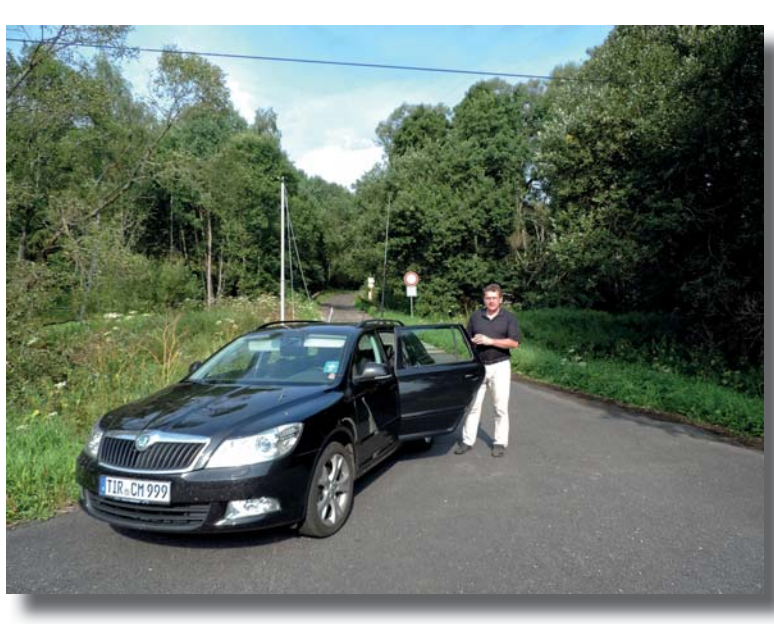
the only possible location

and we were short before closing down. After a final check on 40 meter SSB some more stations arrived, so we could add several stations more into the log. Temperature was rising that day again up to roundabout 28 degrees. Last contact was with DL5ANE at 0940