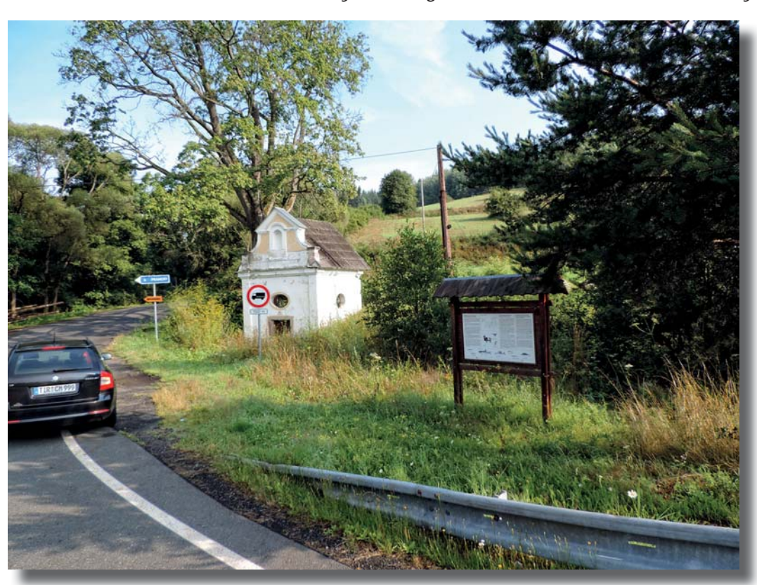
start into the valley of OKFF-1051

Nature reserve Udoli Teple was declared in 1992 and has a size of 172 ha. It 's located between the two wellknown towns of Marianzke Lazne and Karlovy Vary. Udoli Teple stands for "valley of the river Tepl" and is a slim and wounded valley. Through the area leads also a railway line which was built through