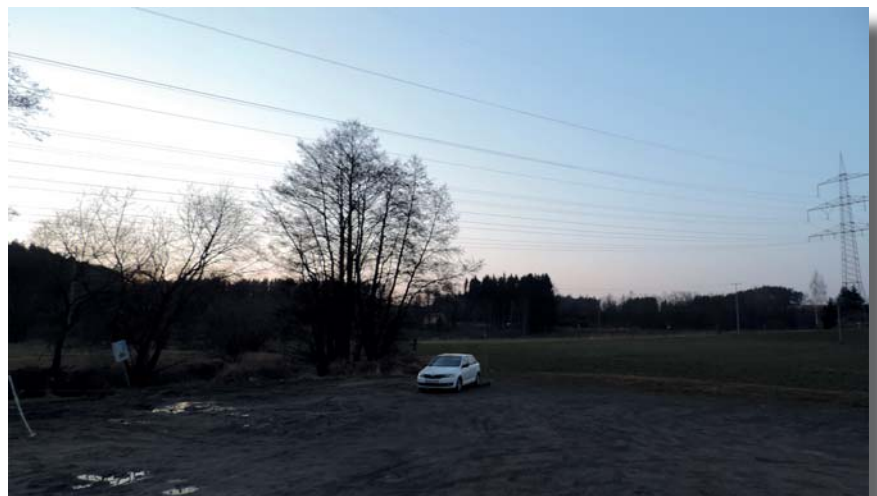
again quick darkness