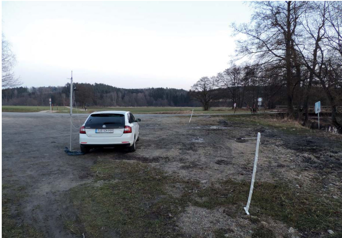
DLFF-143 parking array

With nearly the same time-schedule like one day earlier I left my QRL around 15UTC. DLFF-143 is not too far