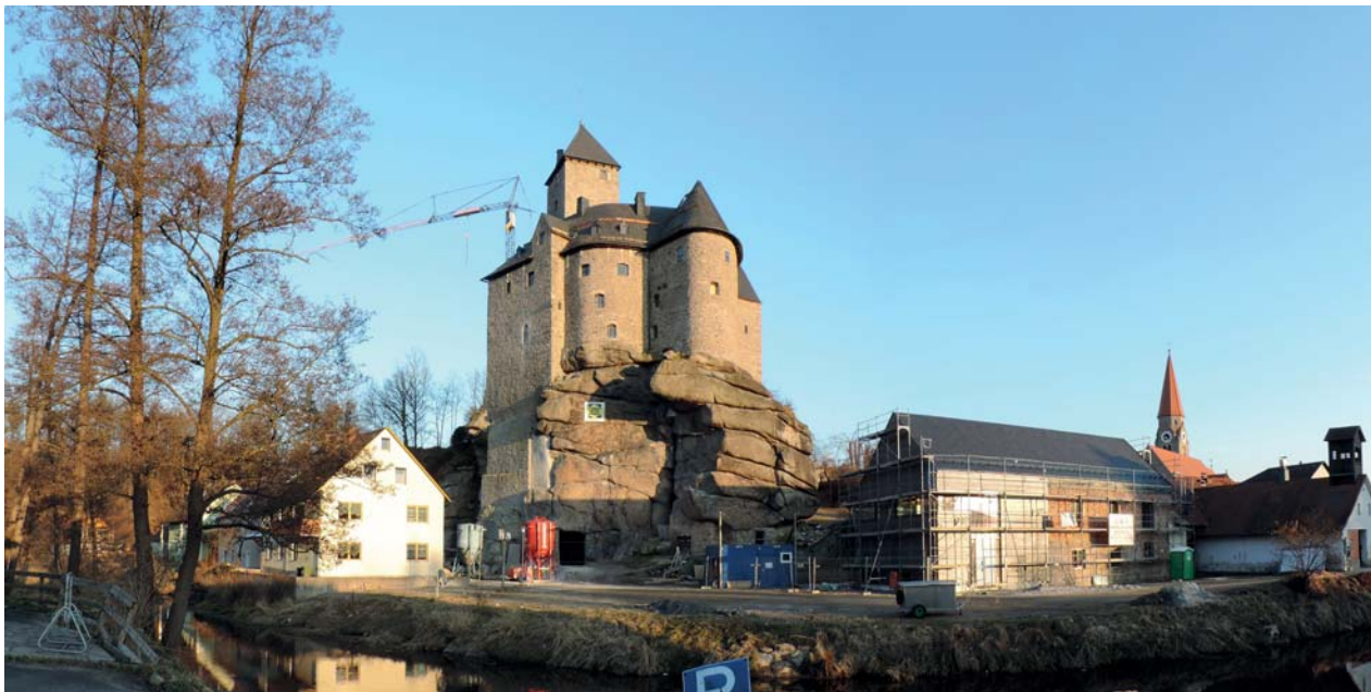
Castle of Falkenberg with a lot of construction work around