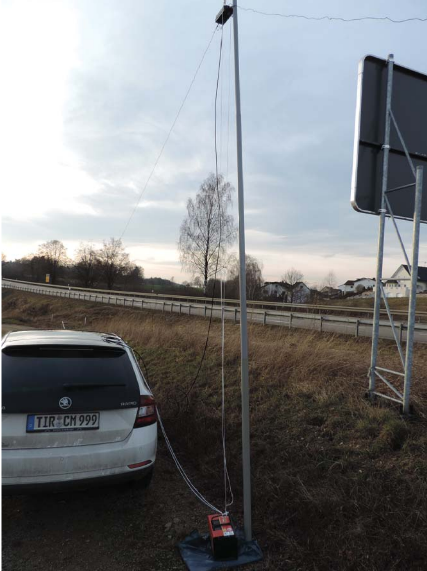
location at the end of the village

Had in the meantime also some visitors with children which wanted to have a look whats going on there near their house. After 80 minutes we closed the station with the latest contact with SM2FYZ on 20 and a summary of 193 QSOs. Last fifteen minutes sky was closing rapidly and became darker and darker. Especially fingers and feet were iccold with meanwhile only 3 degrees outside.