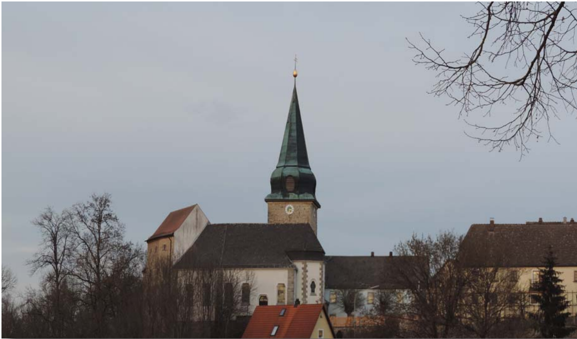
view to the castle

Castle of Wildenau is about 10km away from the city of Tirschenreuth in north-east bavaria. It was built around 1100. The building was almost totally destroyed in 1430 during the hussite-war and then renewed. Since 1992 it's in private ownership of the family Ackermann which restored the castle during the following 10 years. Since that time it's also used for the Wildenauer castle festival which happens all few years.