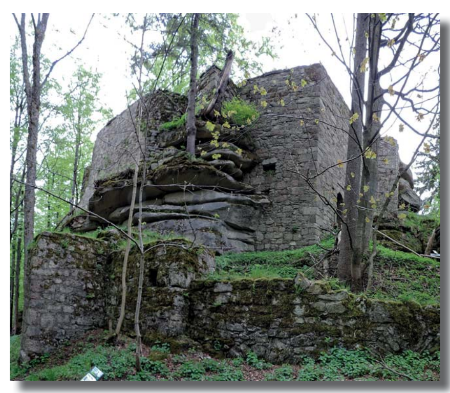
Red castle (Rotes Schloss) at about 850 meters asl with impressive round-view

The castle has different names. Sometimes it was called Waldstein-castle as it 's on top of the Waldstein-mountain. It was built around 1350 by the knights of Sparneck. In the 15th century some of the in earlier times important persons acted as robber-knights and hijacked some prominent persons which were in relationship