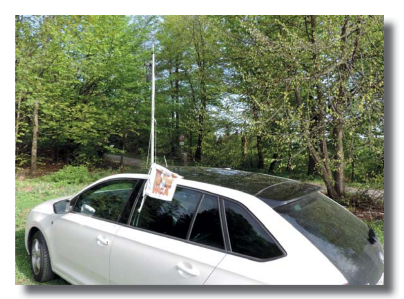
bringing WCA-flag up the mountain

All reports from previous activites can be found at: http://www.grz.com/db/da0cw