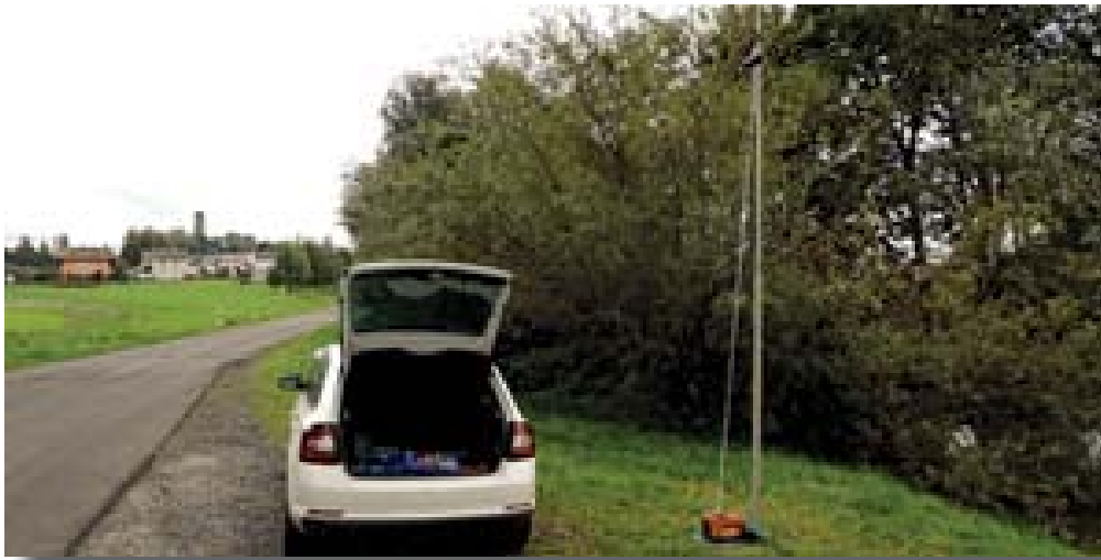
location at the small „Lake Thierstein“ :-)

ver finally used the final time to detect another good place for a coming activity to DLFF-305. So stay tuned if you missed your chance the last time.