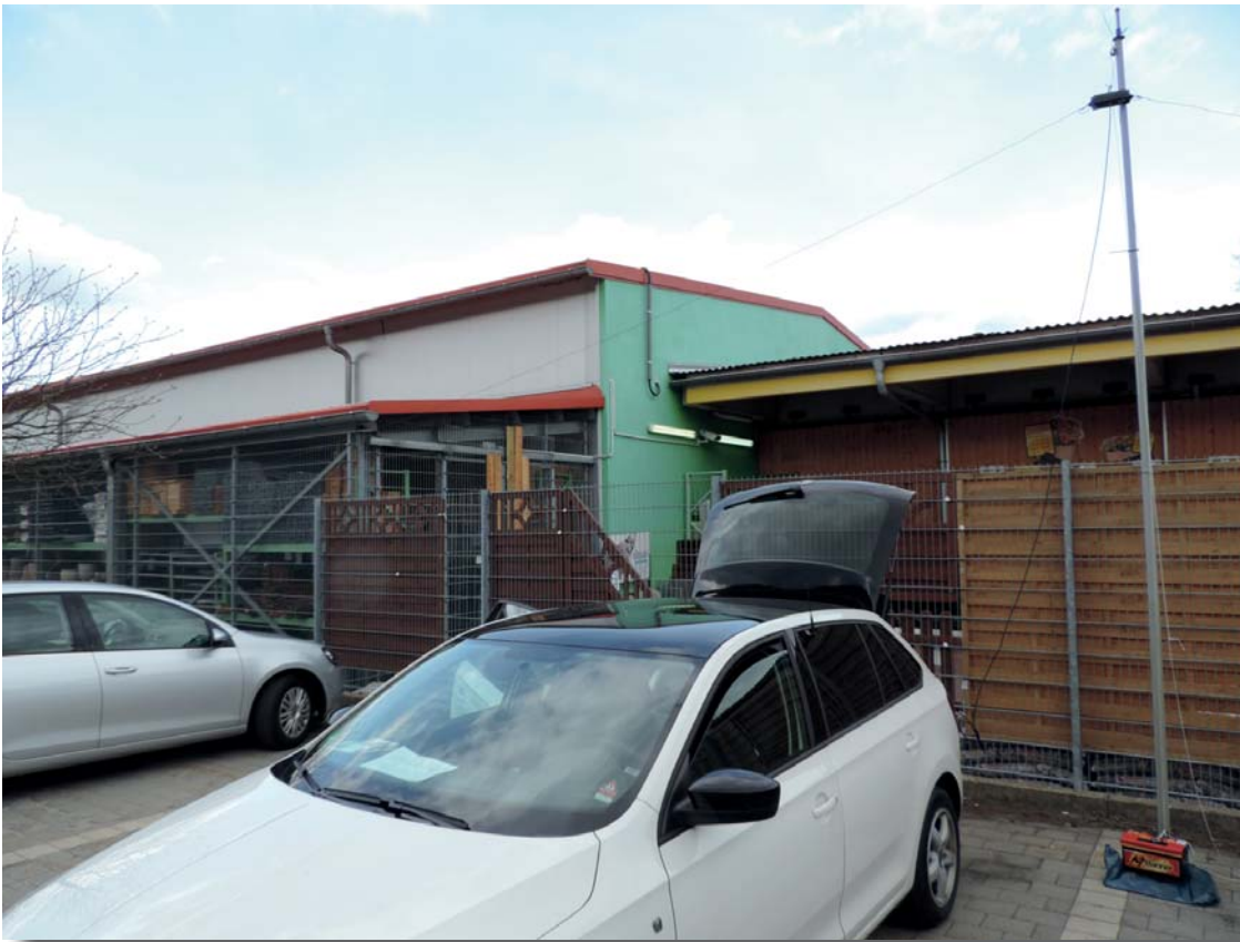
QTH at super-market under the castle

decided to leave the area. Altogether the operating time was 1,5 hours with a result of 190 stations in the log. Database-file was the same evening uploaded into COTA and WWFF-database and will follow to the WCA-database in the coming days.