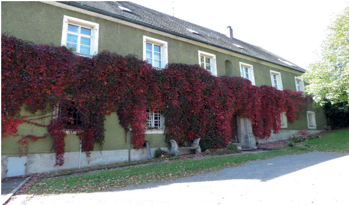
Altenstädter Schloss in Erbendorf

The name Altenstadt comes from the previous name of the settlement which became later a part of the formed town of Erbendorf. The current castle was built in the 16th century but then had been destroyed by a fire. Several added buildings followed before in 1832 another big fire the building destroyed. Meanwhile it 's in private ownership.