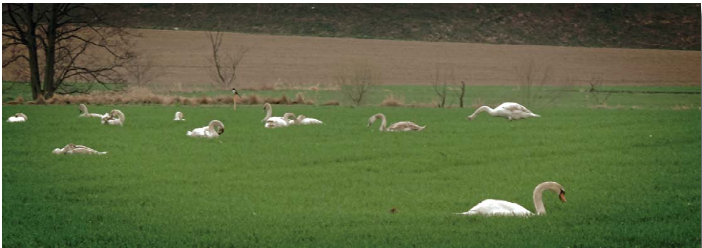
a lot of swan enjoying the area

All reports from previous activites can befound at: http://www.qrz.com/db/da0cw