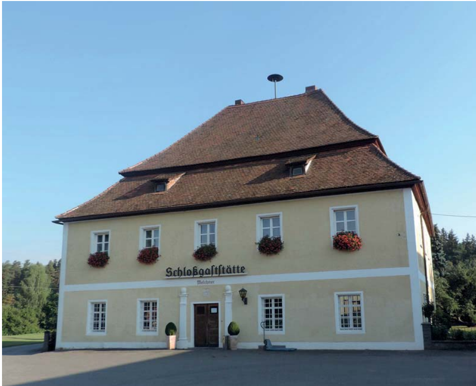
castle in use as restaurant

Our originally planned destination for that day should be another castle in the area of Waidhaus on the czech-border. However when switching on shortly in the morning the equipment at home, we found the propagation very poor. As we already had announced the trip and for sure some friends were waiting, we decided to cut the activity to a location which is closer to our homebase. We selected the castle of Rupprechtsreuth as we wanted to find also a location for a new-one WWFF-activity after the castle-trip. We were right in time when reaching Rupprechtsreuth and asked the son of the current owners of the building, if it´s allowed to take some photos which was no problem at all. Rupprechtsreuth belongs beside three other small villages to the market town Mantel. We moved a bit on a side-road to have more space to hang up the dipole. Weather was sunny the whole time with an acceptable temperature of around 23 degrees. Started the activity at 0703 UTC with SP5DZC as first log-entry on 40 meters. Some minutes