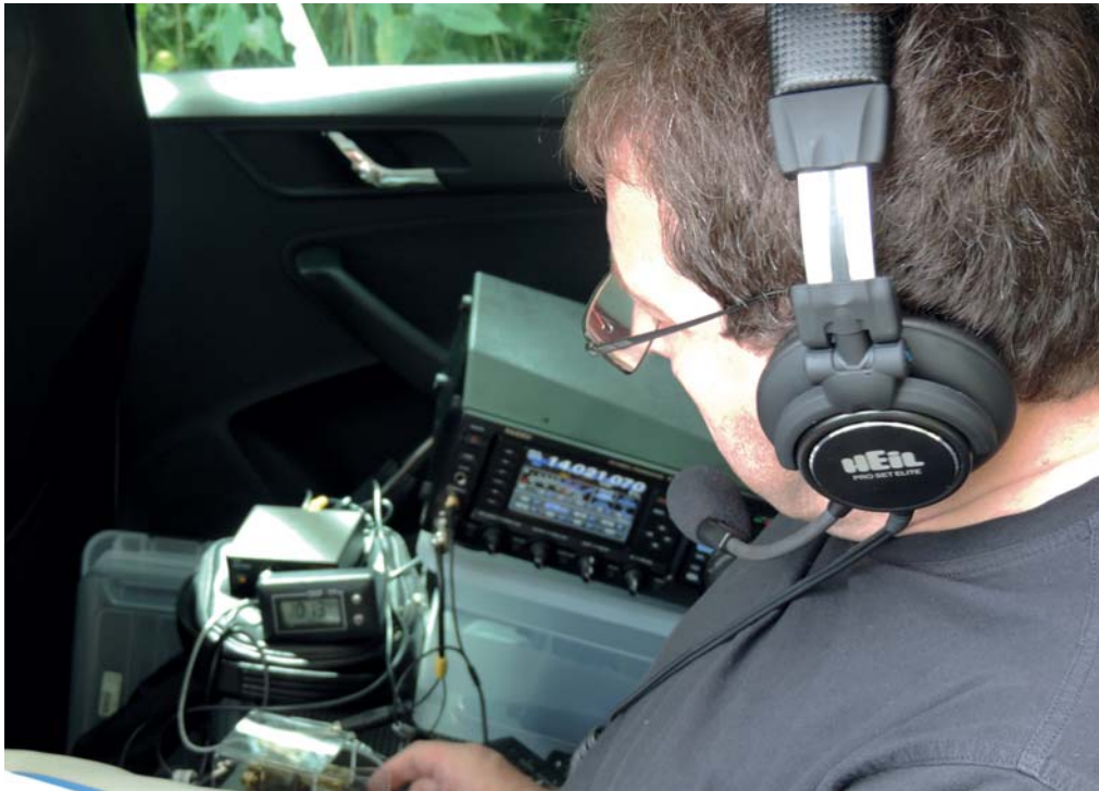
first time with new transceiver in the mobile-shack

higher and so on, however at the end it shall mainly remain a car, so you have to find some compromise. Finally after 2,75 hours we had 277 stations in the log. 29 % with germany, 13 % with italy and 11% with russia. Thanks to all callers and listeners and of course to those who spotted us.