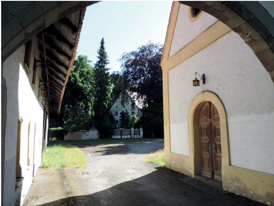
view into the inner yard with the main-building

The hammer-castle in Unterwildenau is composed by a small chappel, an access yard surrounded mostly by a wall. The main-building was constructed in the early 17th century, additional building followed in the 18th and 19th century. The chappel includes an interesting acanthus-altar.