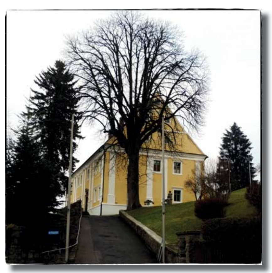
side-view from Castle Floss

Easter-time in the past years was always a time were additional castle-trips were done. This year two weeks ago