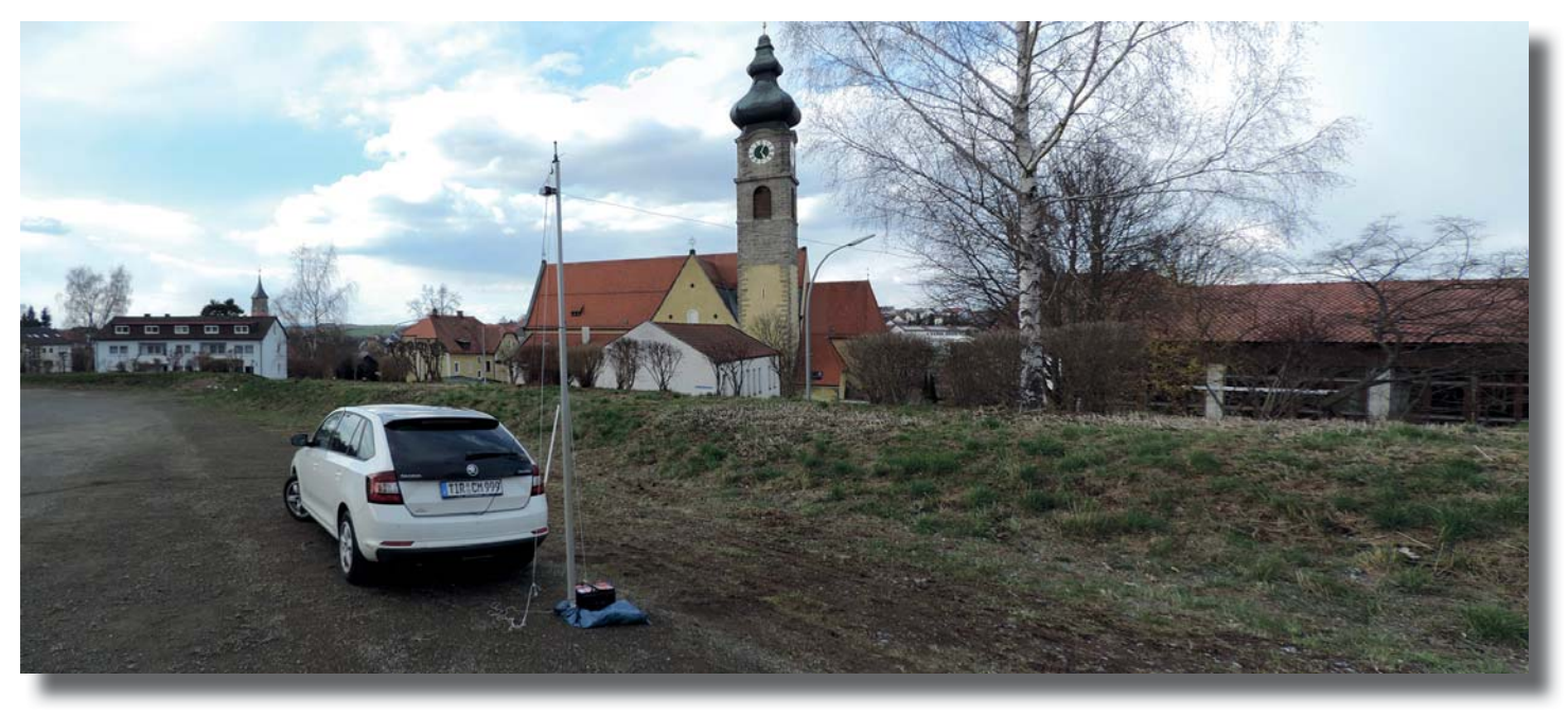
location behind the town-hall about 50 meters away from the castle

After around 20 minutes game was over. Several calls were unanswered and I tried my luck on 20 meters CW with also not too many interested stations which led me sooner or later back to 40 meters for the last thirty minutes of activity. Until that moment about 145 stations made it into the log, however 40 meters was again a magic band. After some CW-contacts moved again up around 7.149 and just after the first spot was done a lot of stations came in and produced a very successful and funny final 30 minutes. Weather was still changing bet-