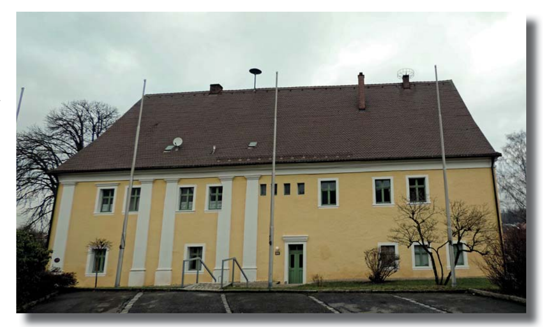
Pflegschloss Floss shown from the town-hall