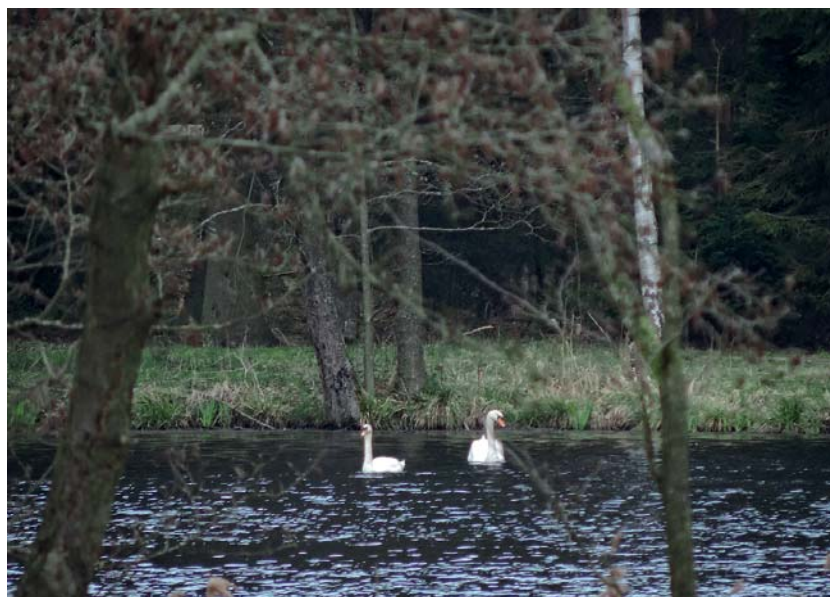
a pair of swan in the next pont

We moved at first to 20 meters and the band was almost a thump noise only. We heard RA3PCI with good signal but that was the only one on this first attempt.