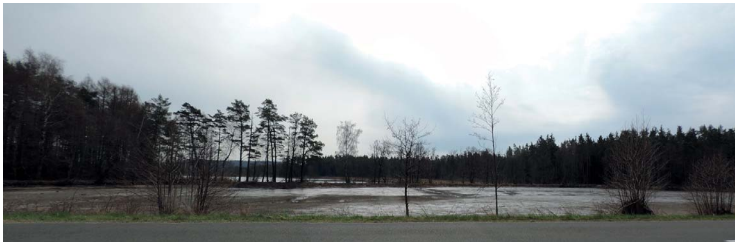
one of the numerous ponds on the opposite-side of our location currently without water

Nature-Reserve Eschenbacher Weihergebiet has a total size of 103 ha and is located in the middle between the towns of Bayreuth and Weiden in north-eastern-bavaria. It´s an important area for bird-migration, has especially a high population of swan and was elected in 2003.