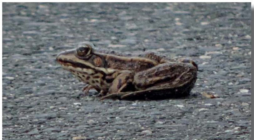
a small visitor beside the car