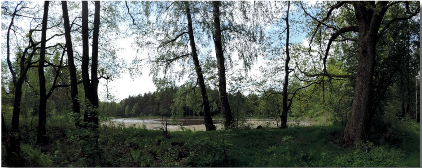
this time location on the Schlammersdorfer pond

On our first activation my original plan was to settle at this location. It´s a small road leading directly to the ponds some meters down into the wood. However last time there was fishery science with heavy equipment active, so we couldn´t enter.