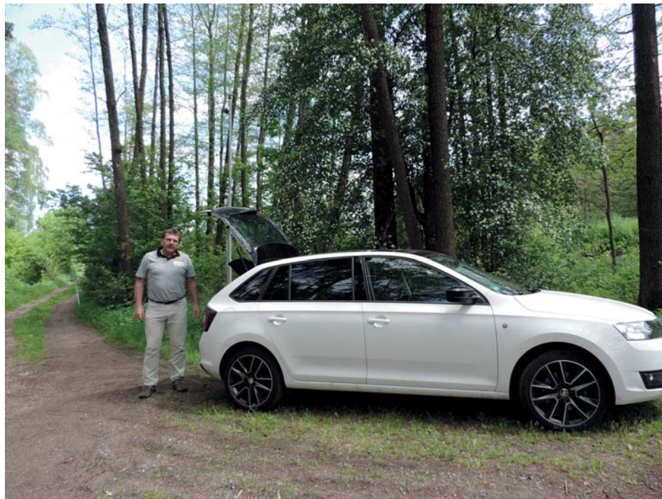
preparing the station on a small sideway

Our location from one month ago became meanwhile totally overgrown and was no choice for us this time.