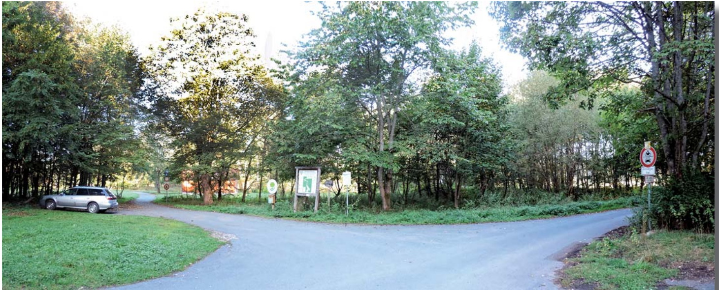
starting point for any tour into the area

had to work by numbers as the pileup was extreme we could top our previous record result to 195 stations in the first hour. Apparently also the equipment was working well and a lot of stations confirmed a loud signal. We used the FT450 powered by a separate 72AH-car-battery. In phone we made full power 100 watts. In CW had to reduce the power a bit to avoid some RF inside the keyer-electronic but also the 70 watts of course were enough. Of course main-point for the successful activity was the good and clear frequency which could be defended so long, anyway there was some contest-activity around.