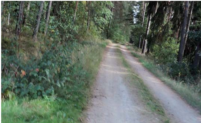
way into the Pfahl

The Pfahl is a mountain range composed of quartz crystal with a total length of 150 km, which starts at Nabburg-Oberpfälzer Wald, going through the northeastern area of bayerischer Wald (bavarian wood) till Linz in Austria. 300 million years ago, along this line opened the earth up to 120 meters wide as an abyss and the outcoming liquid stone crystalized as quartz. This geologic formation is unique and in the nature reserve Pfahl you have a 3km long part of this formation which you can see at a look-out in the small village of Fuhrn.