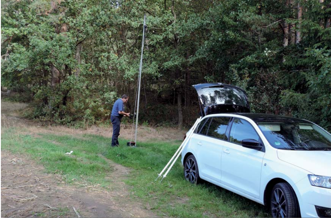
start for an unexpected short operation

field were our station was. At the first run he kindly started with the lower half of the field but we were prepared to leave rapidly. When the tractor left with empty trailer we continued for 15 further minutes but the originally planned switch to CW and later coming back to 40 meters had to be dropped. When we heard the machine again refilled coming, we pulled down everything in 5 minutes, simply hit it into the boot and had to reorganise it later on a more save place. The natural smell on the whole area was coming closer and we left quickly.