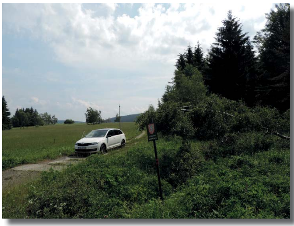
nature-park shield and only entry with a car