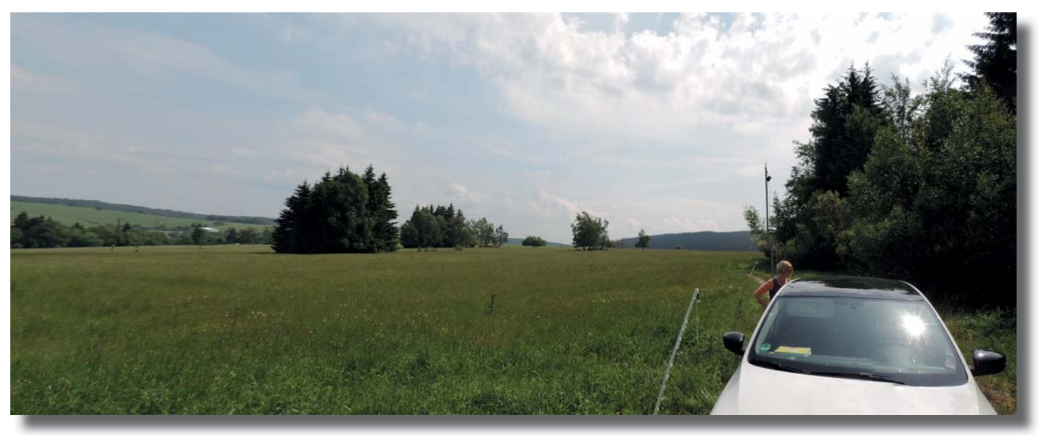
view into the meadows on the border-area of OKFF-0722, left in the backround the small village Mnichow

Mokrady Pod Vlckem is a protected-area issued in 1995 with a size of 40 ha and located at abt 760 meters asl into the nature-park slavkovsky les OKFF-0006. It consists by a mix of grass-meadows, wetland and wood with several ponds inside and some gas-discharges along them. Distance to the well-known town Marianske Lazne is about 10 km.