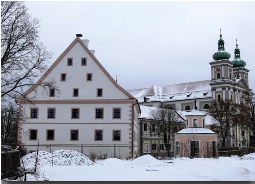
Abbot-Castle with neighbored Basilika-church

The russian WCA-team invited this year again for their happy-birthday castle-weekend. Six years ago the group was founded to promote portable activities from historic buildings like castles, palaces and fortresses, to remind on the historical importance of that objects.