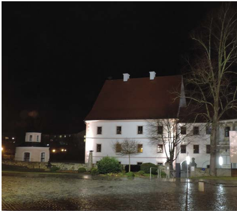
Abbot-castle at night

When first wave of stations was worked on 40 meters we tried again on 20 and finally had there also some short openings.