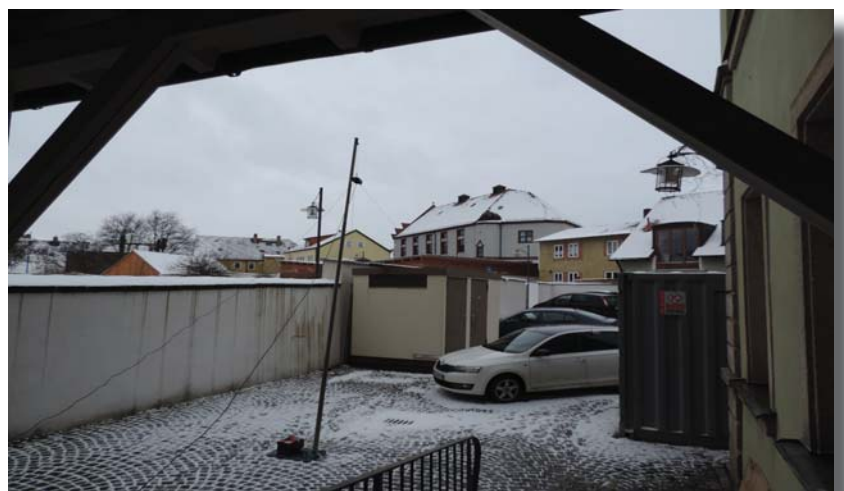
antenna behind the city-hall

Altogether contacts with 19 different countries were done.