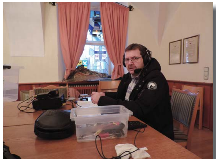
operating position in the city-hall