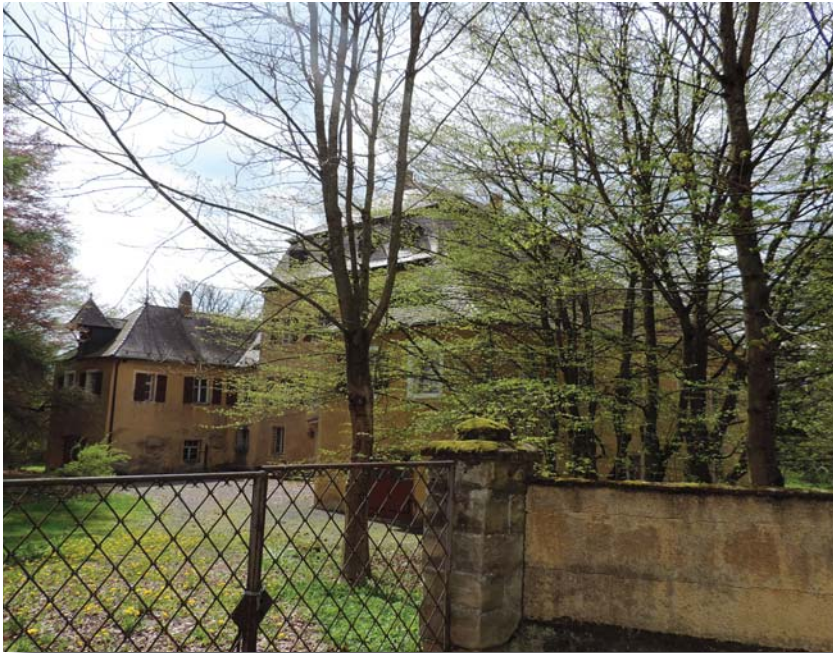
Castle Kaibitz WCA DL-04412 BOB-114