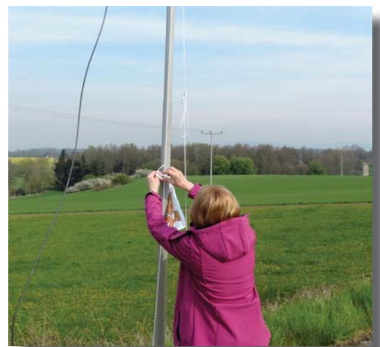
WCA-flag on the way up

While first 15 minutes appeared normal but then the band changed rapidly and often called 4-5 minutes without any reply.