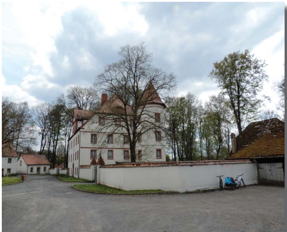
Castle Wolframshof WCA DL-04947 BOB-142