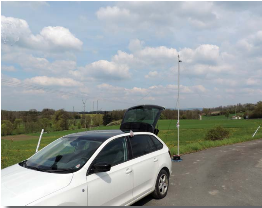
our setup between the two villages

My first plan was to make another activity in the afternoon but under that circumstances I dropped that. So alternatively would try to bring my home-castle DL-02335 Falkenberg on the band and maybe work also some new castle multiplier.