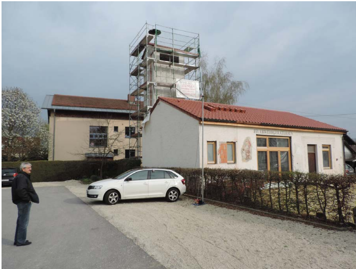
our setup with Konrad DH6RAE in the foreground

for the homeway. When arriving in Falkenberg at 1700 UTC it was just the first part of the day and we both had to drive to Waldsassen for our local club-meeting.