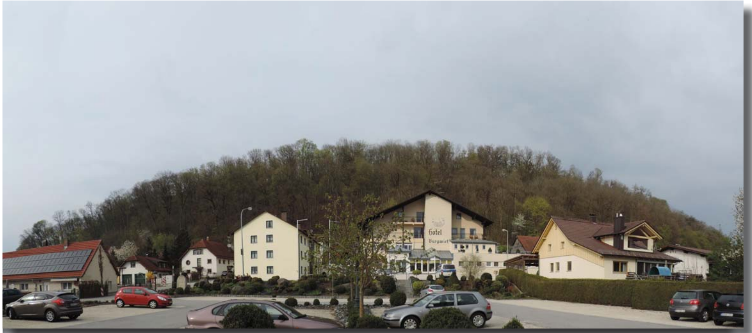
hill with the remaining parts of the castle on top behind the restaurant, where the meeting happened