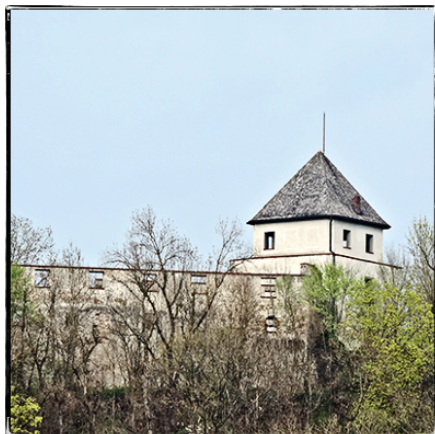
the tower and the ringwall

A day full with ham-radio-themes. When receiving the invitation of our DARC-district-meeting quickly found out, that the location is directly 100 meter under a castle. Together with my colleague Konrad DH6RAE, we started at 0530 UTC in the morning for the 200km trip to Deggendorf. We arrived good in time around 0730 and the meeting started 30 minutes later. We had all equipment from the activity one day before with us, so the plan was, if right in time, to make a short activation there. After dinner-brake and the open points in the afternoon, the meeting ended at 1345 UTC. There was no time to change for another position so we set up the station directly at the hotels parking area and were QRV after good 15 minutes. The first station in the log was Toni SP/DL1EKO calling in on 40 meters SSB. Propagation was again not so well and of course also maybe a bit too early in the afternoon. Some german areas had good chance but some were totally faded out. Running 100 watts out of a separate car-battery with the FT450 and the dipole-antenna was around 4 meters up along the fence to the local fire-department.