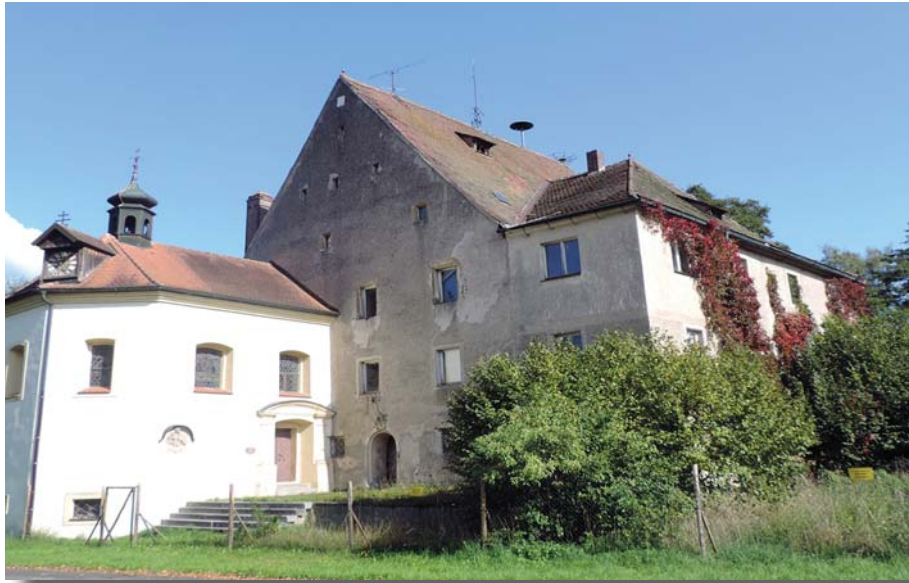
Castle Steinfels with the small chapel aside