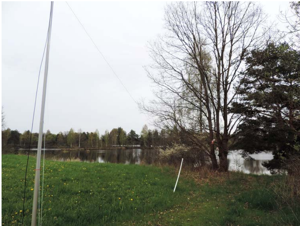
antenna-location, on the tree behind some children had prepared with some small puppets

nic WWFF and WCA and COTA-database and later we send out a photo-QSL for several activities together but we don't collect our own, please send also no card for the operator.