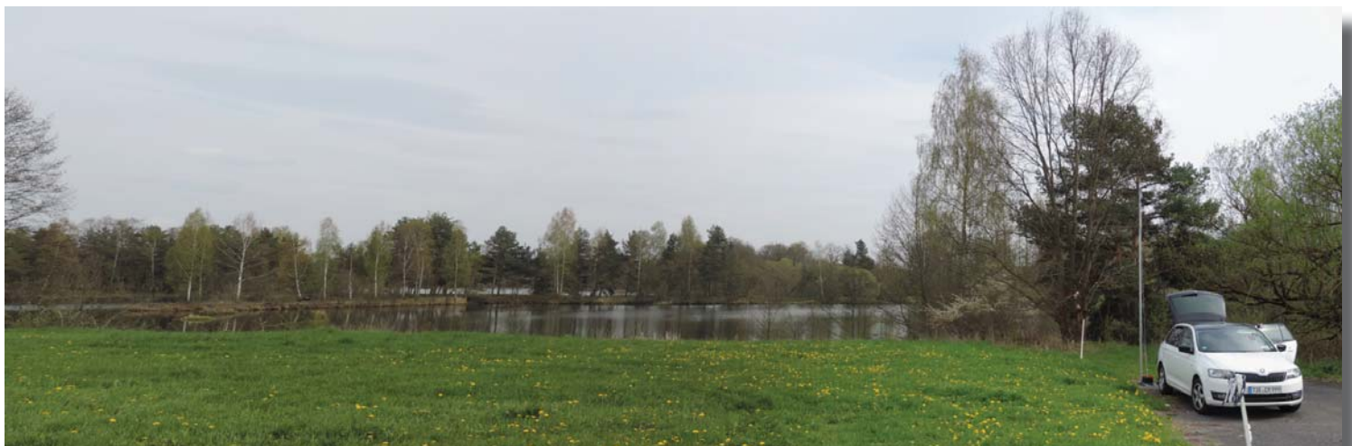
Location at DL-04406 in DLFF-0093 with a lot of seagain behind :-)

Selected a small parking range were you can stop and walk into the river and pond-area. Weather was dry but not so warm, around 12 degrees but sunny and the car warmed up extreme during the following two hours with steady sunshine. Started with the first call at 40 meters replied by SQ2TOM at 1410 UTC. Pileup was sometimes amazingly. In the first 45 minutes more than 100 stations were logged. Then changed to 20 meters but not too many came in there. When moving back to 40 meters CW had again an incredible amount of callers in CW but some trouble