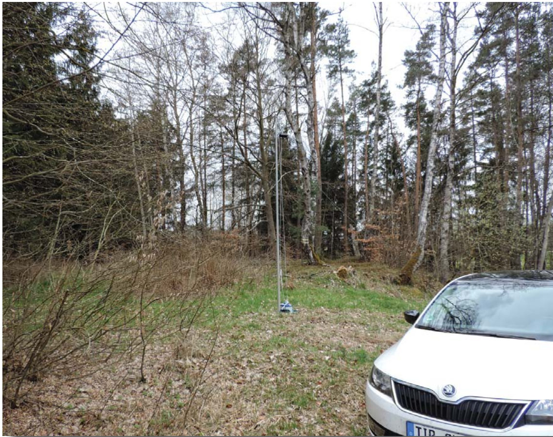
location at the edge of the village

It was now 1503 UTC and original planning was till about 1530 as I finally had also to drive home. Score till now was just 46 contacts. When changing to SSB found the band much more populated and the usual area between 7.120 and 7.150 was totally full. So moved up until 7.177 and found there an almost silent frequency.