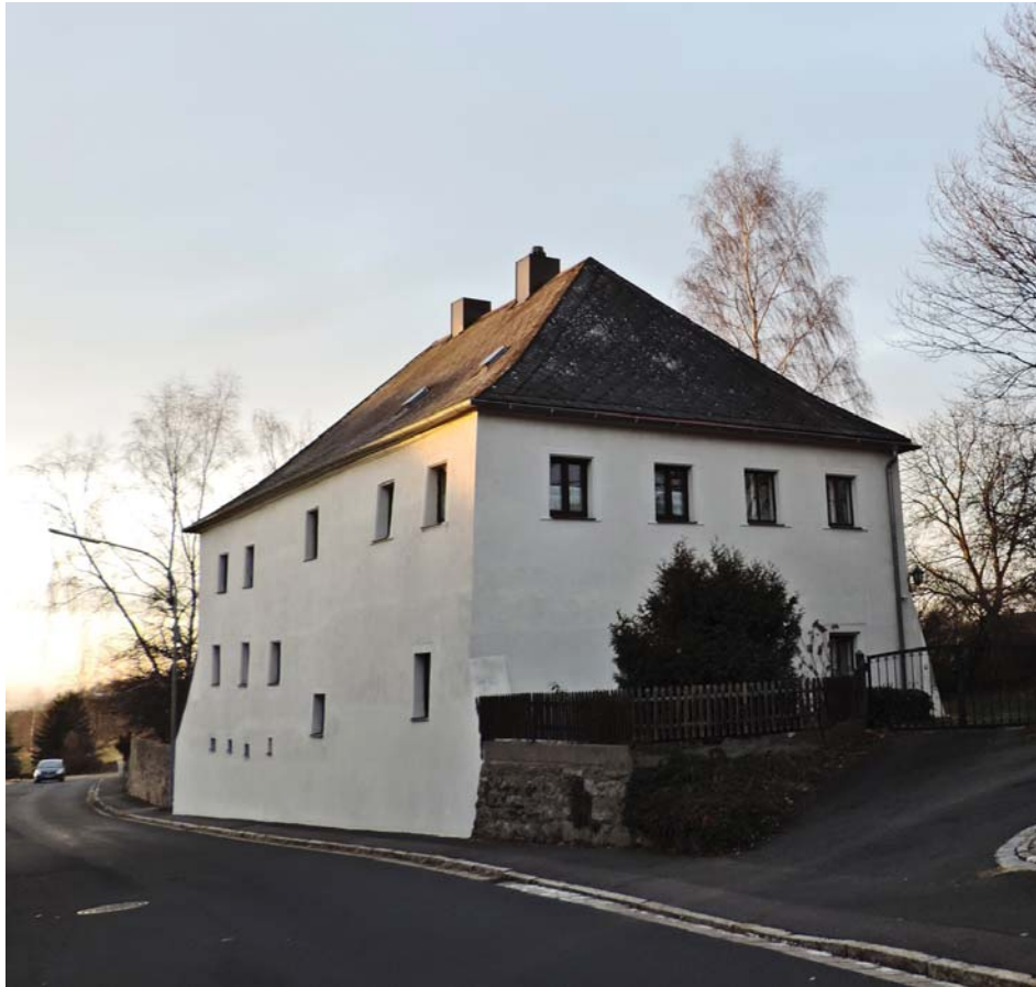
Neues Schloss Plößberg

Plößberg was in the middle the former so-called Goldenen Strasse (golden road) between Prag and Nürnberg. The village is located near Tirschenreuth. The first castle was built here in 1052. Together with Schönkirch and Wildenau it was one out of three bohemian fief in northern bavaria. In the time around 1428 also in this village the hussite penetrated and burned down the whole village. Around 1600 the dreaded robber-knights Prenger resided there. The current new castle in the same road was last time rebuild in 1751 after a heavy fire in 1614.