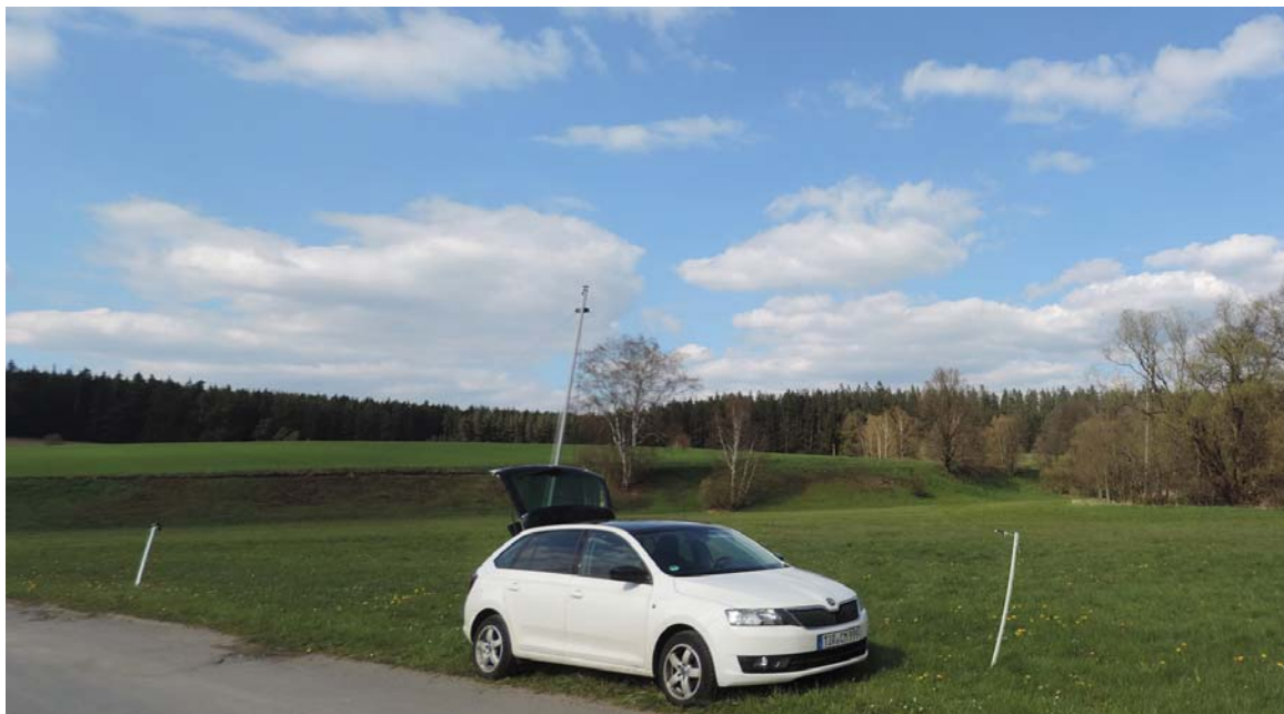
meadow-area in DLFF-0305

Apparently there is quite a big demand on that multiplier as the first hour was like a firststone-activity. 175 stations made it into the log. Then the rates dropped down, some stations respotted me again but seemed that most of the stations got it so moved to 20 meters. SSB was not so productive. Could work some