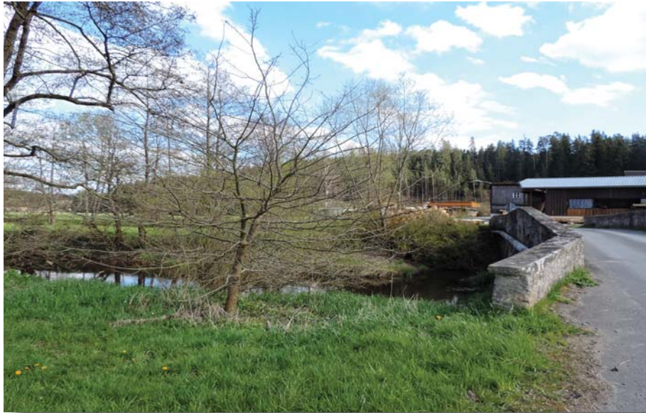
the small bridge above river eger

After my first activity from DLFF-0305 in september 2015, I received some mails that, due to that very changeable conditions that day few stations missed the multiplier totally. First activity was on the one end of the valley closed to the czech border in an area covered extreme by trees. So after my activity from the caste of Thierstein at september 25 2015 I discovered the opposite side from the egertal and found another more suitable place directly at the entry in a meadow area but that time was late evening and no more chance to become QRV.