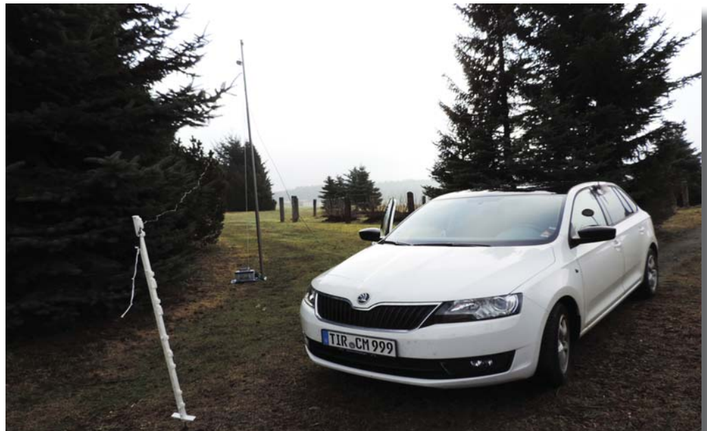
our accomodation for about 2 hours