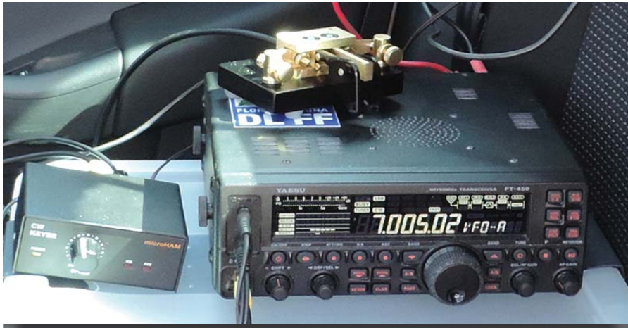
first short test with the new keyer

The nature reserve Dreiländereck is located on the border where former BRD with bavaria, former GDR with saxonian and Czech Republic met together. The area has a size of 135 ha and was elected 1992 in IUCN-category IV. Main target is to protect the freshwater pearl mussel which is a threatened species.