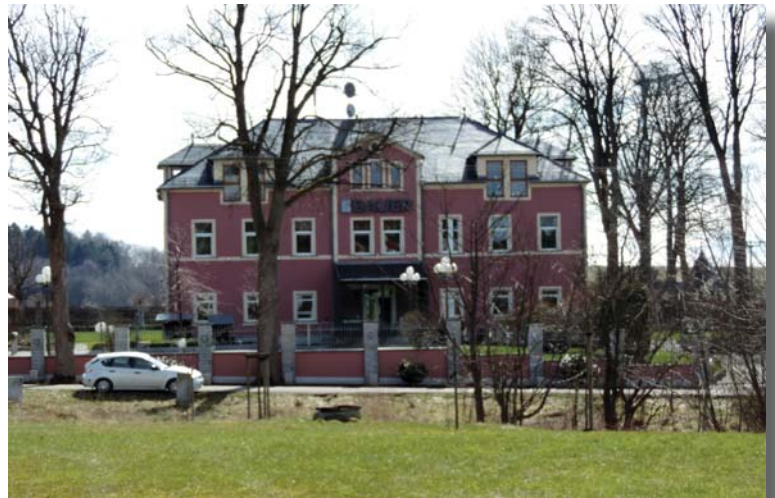
Former Castle of Ebmath

Hope to meet you from the next portable-activity.