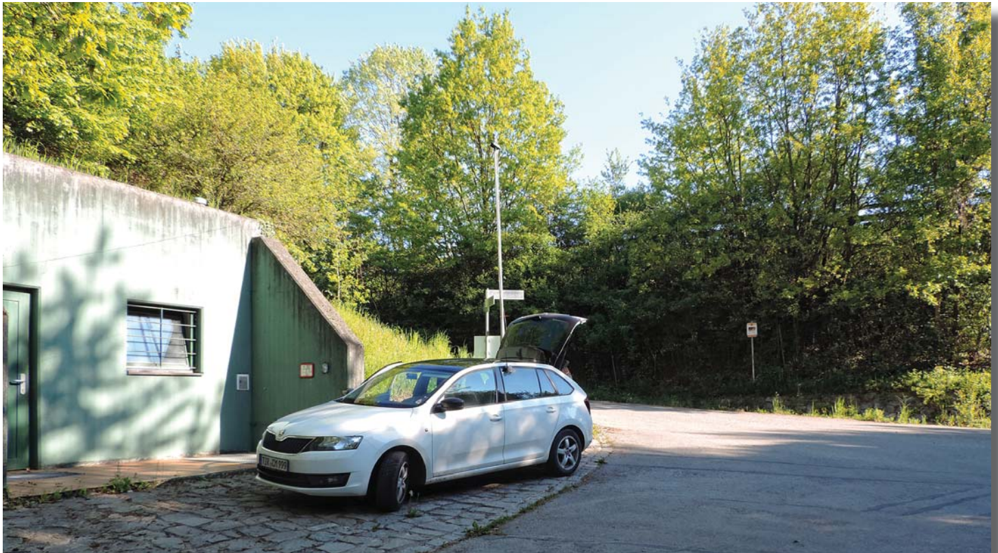
shadow beside the water-house close to the fasttrack

down as many as possible without too many changes. Also spots in the cluster didn't help anymore at the end so we finished with R7AY as latest station on 20meters at 0807 UTC.