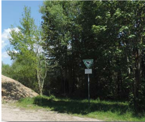
entry to the area

In the first hour we had 147 contacts and then it was drying out more and more. 15minutes before the end we moved back to 20 and had there again a short opening.