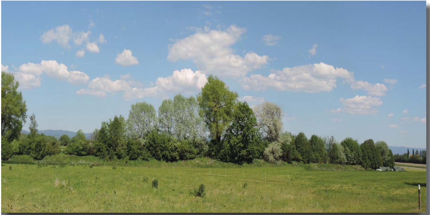
view into the area from seen from Donau

Öberauer Donauschleife with a size of around 300 ha is located close to the city of Straubing and is an important bread and resting-area for a large number of different bird species.