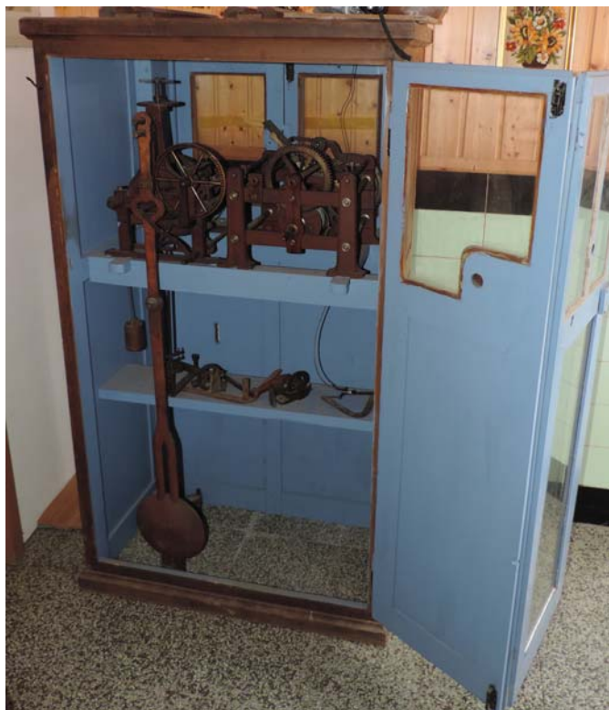
the ancient clockwork from the castle Wendern