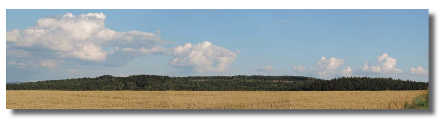
view to DLFF-0288 from my working-location