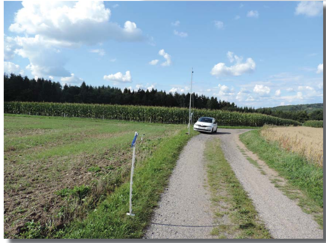
location above the small village

the school-holidays and we preferred to do some sightseeing in the closer area. However weather was not so good for out-door-activities and so I used the only better day for an afternoon-castle-activation.