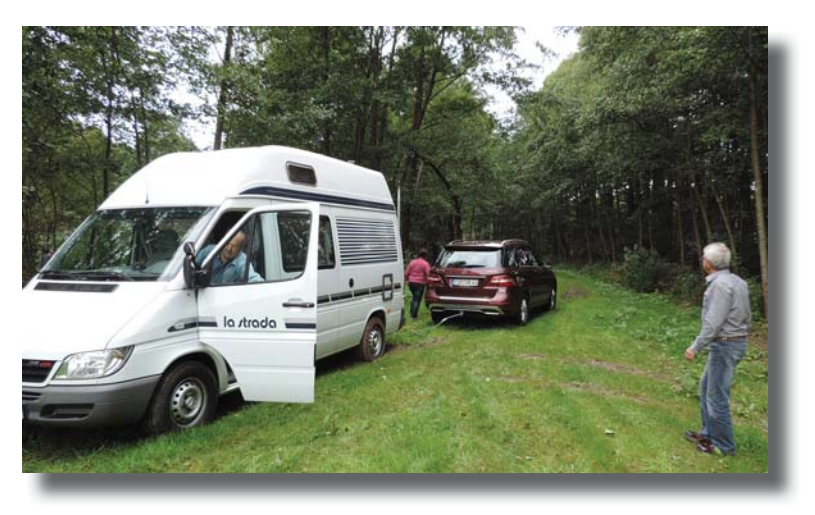
Günter's rescue-team brought the caravan out of the area