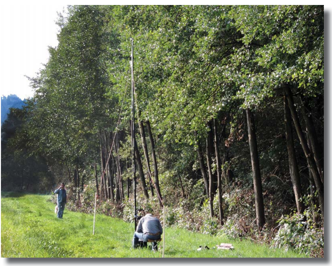
Konrad DH6RAE started with the 20meter station aside the pond

First target destination was not possible so when driving along we found a small road directly behind a corn-field, leading into the area. But nowhere was enough place to rest, as the road was too small. Finally after the begin of the reserve we detected a