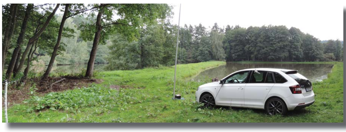
second station in front of the pond

continued with the traffic but then dismantled the first station.