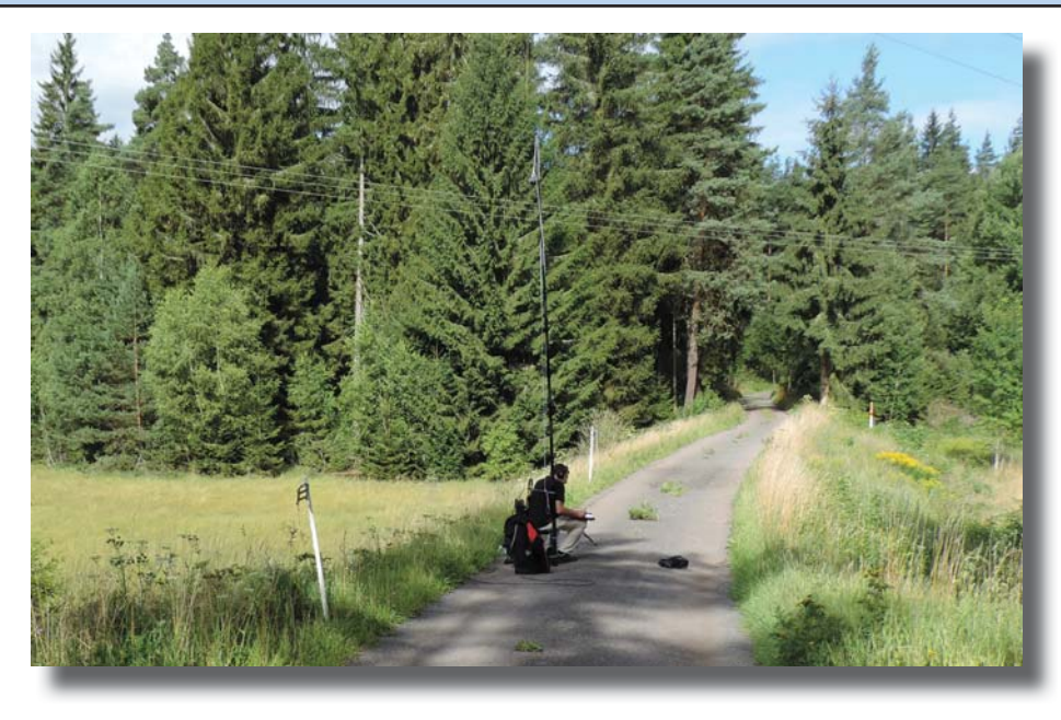
Manfred DF6EX on the station

IK2YXH as latest station and prepared everything for the homeway.